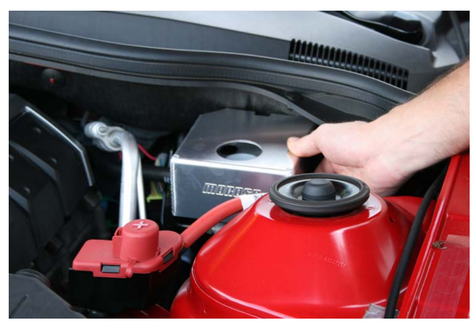
Step 4: Place cover over brake reservoir