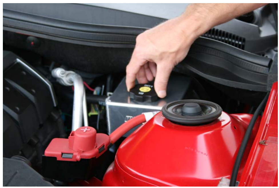
Step 6: Reinstall fill cap