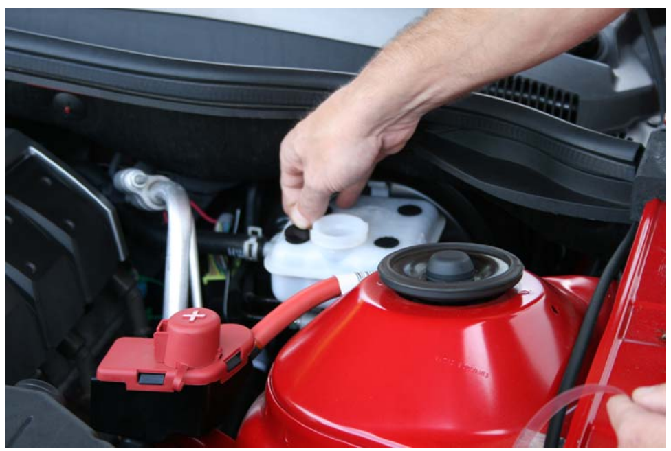
Step 3: Place Velcro hooks on top of Velcro loops previously installed