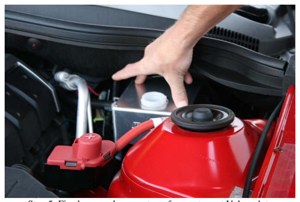
Step 5: Firmly press down on top of cover to seat Velcro dots