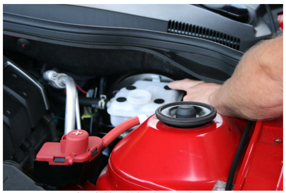
Step 2: Place Velcro loops as shown