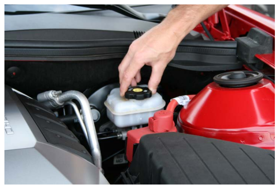
Step 1: Remove fill cap