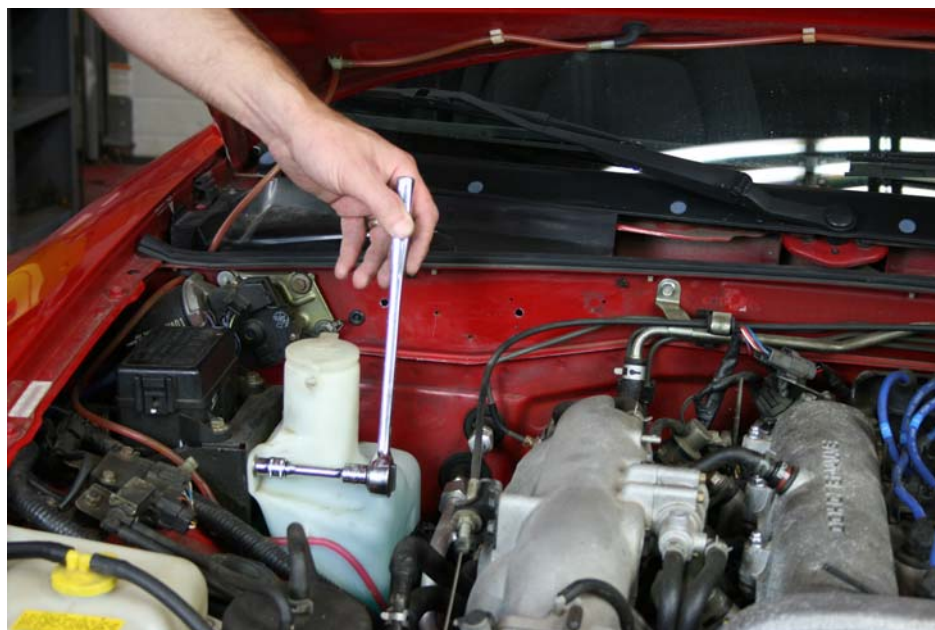
Step 9: Reinstall windshield washer tank mounting bolts