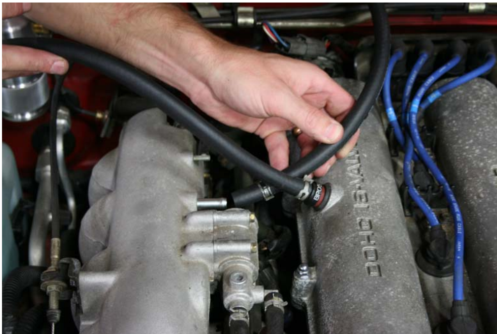
Step 19: Install hose over nipple and install hose clamp