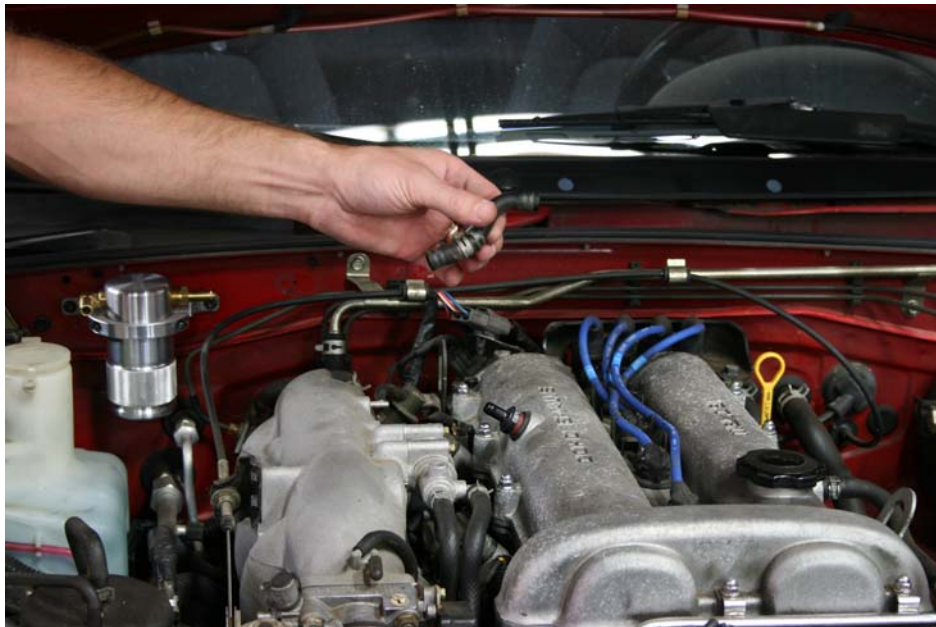
Step 14: Remove PCV line from vehicle and remove hose clamps for re-use