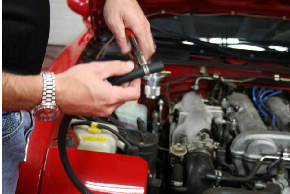
Step 15: Install (1) hose clamp on one end of 19" hose