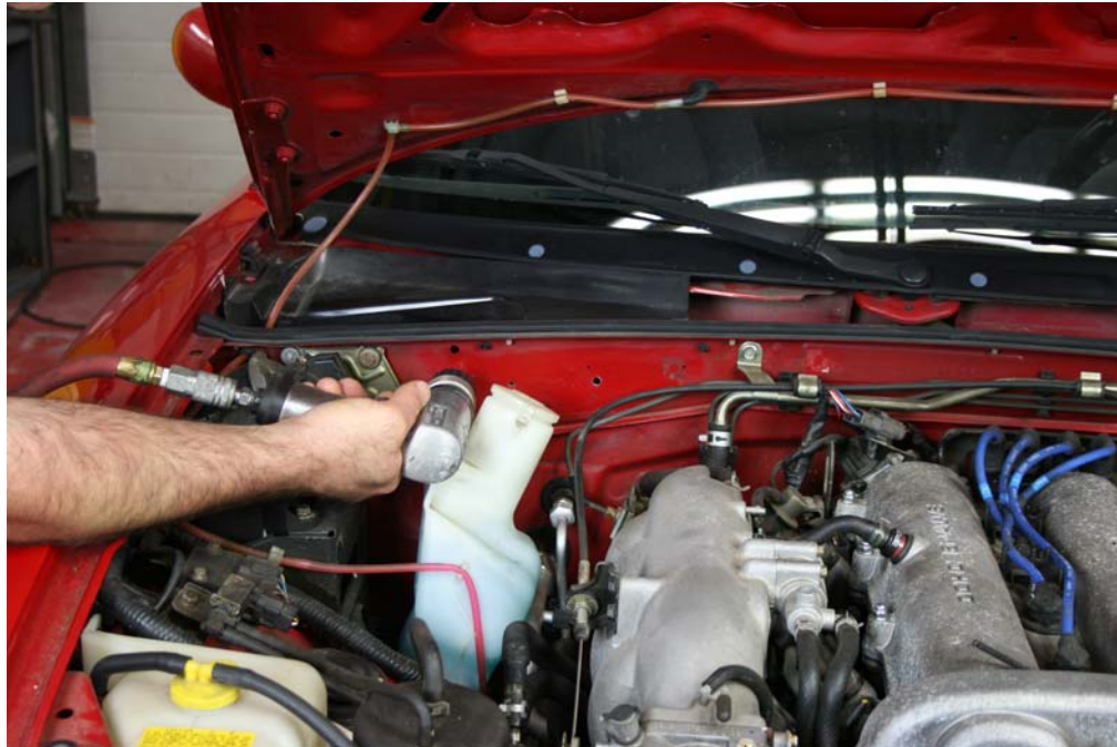
Step 8 Drill Second 1/4" mounting hole at other location