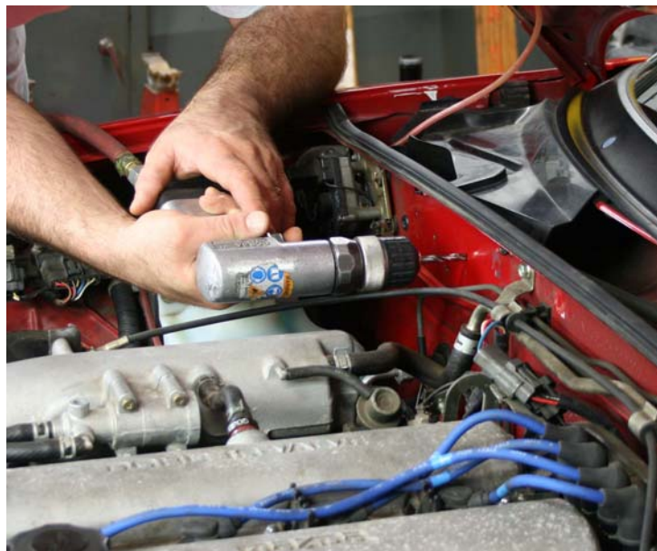
Step 7: Drill first 1/4" hole at marked location