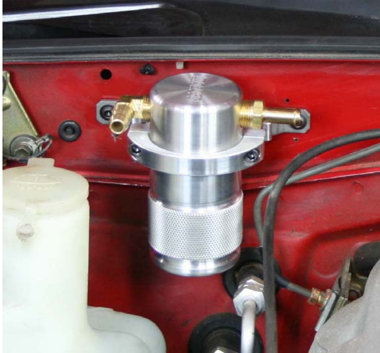
Step 10: Install Air Oil Separator using (2) \frac{1}{4} x 20 x \frac{5}{8} x BHCS