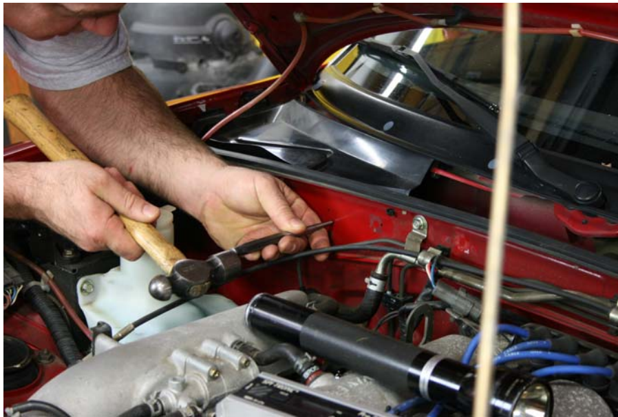
Step 5: Center punch hole locations previously marked