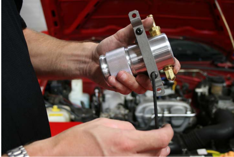
Step 3: Assemble billet clamp and stainless mounting bracket using (2) \frac{1}{4} x 20 x \frac{5}{8} BHCS