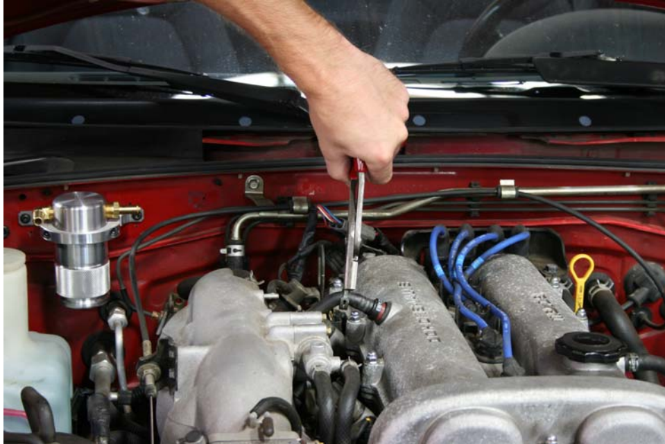
Step 13: Remove hose clamps