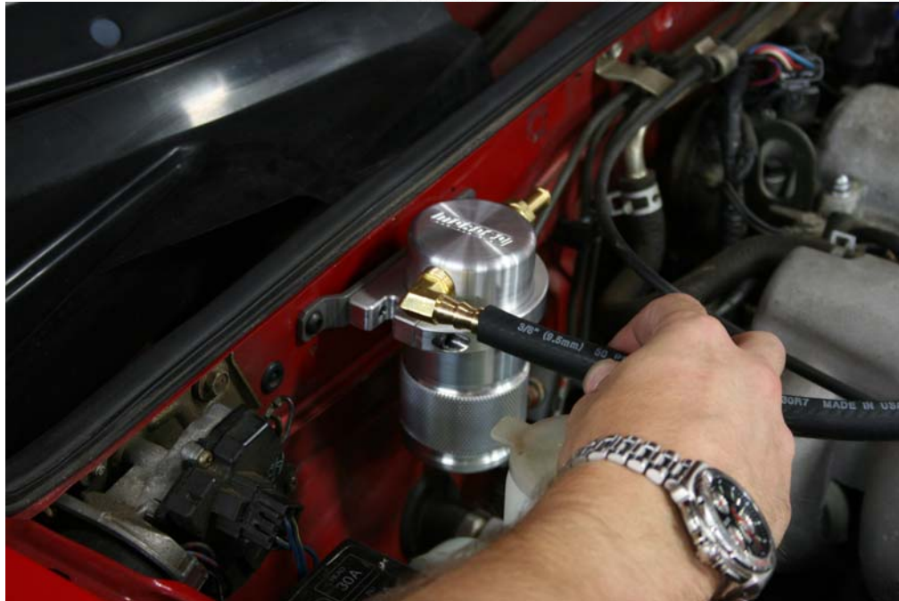
Step 17: Install other end of hose to Air Oil Separator as shown