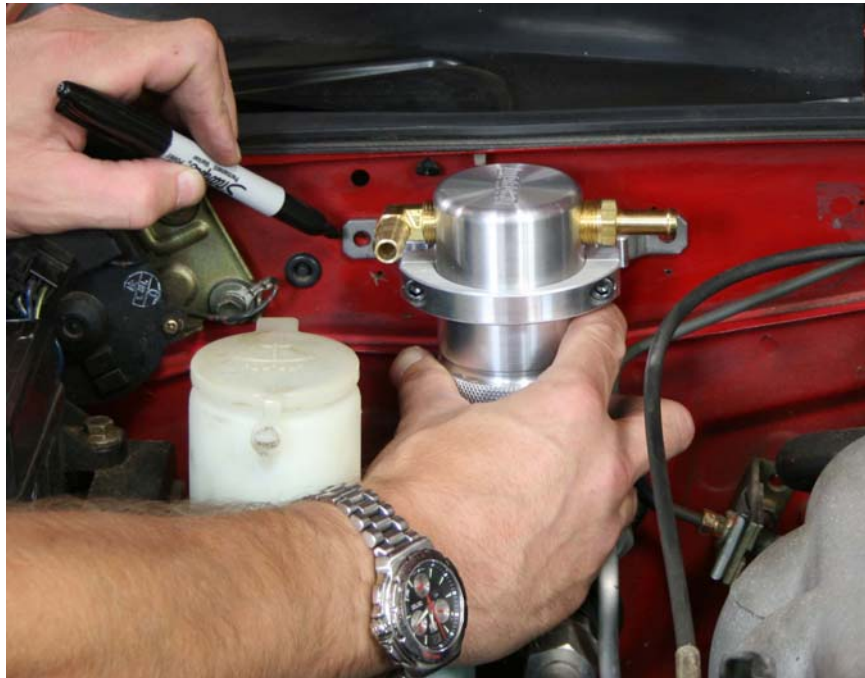
Step 4: Mark location of mounting holes on passenger side firewall (2) places