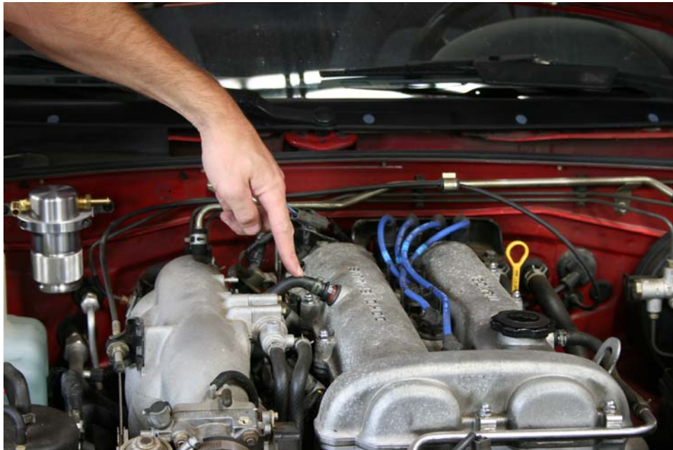
Step 12: Locate PCV line