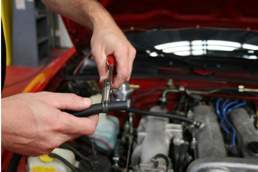
Step 18: Install (1) hose clamp on one end of 19" hose