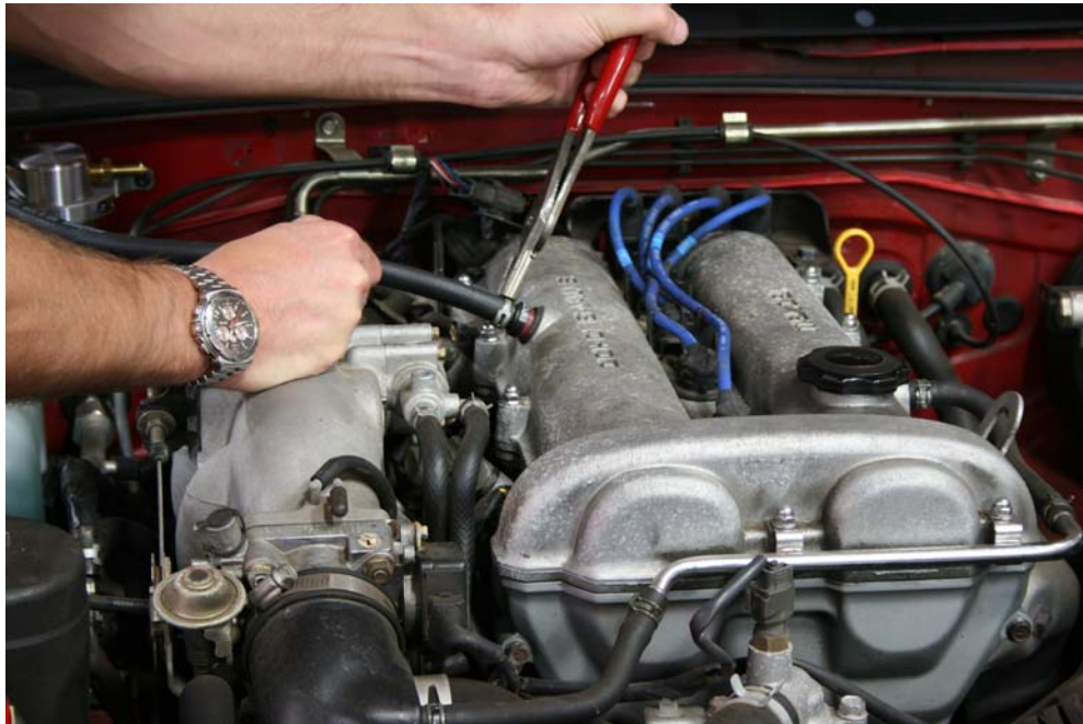
Step 16: Install hose over PCV nipple and install hose clamp