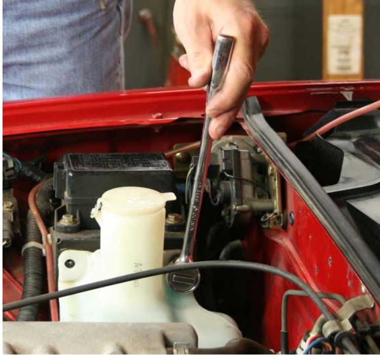
Step 6: Remove (2) mounting bolts from windshield washer bottle