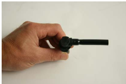
Step 10 You will now have 2 pieces that look like above