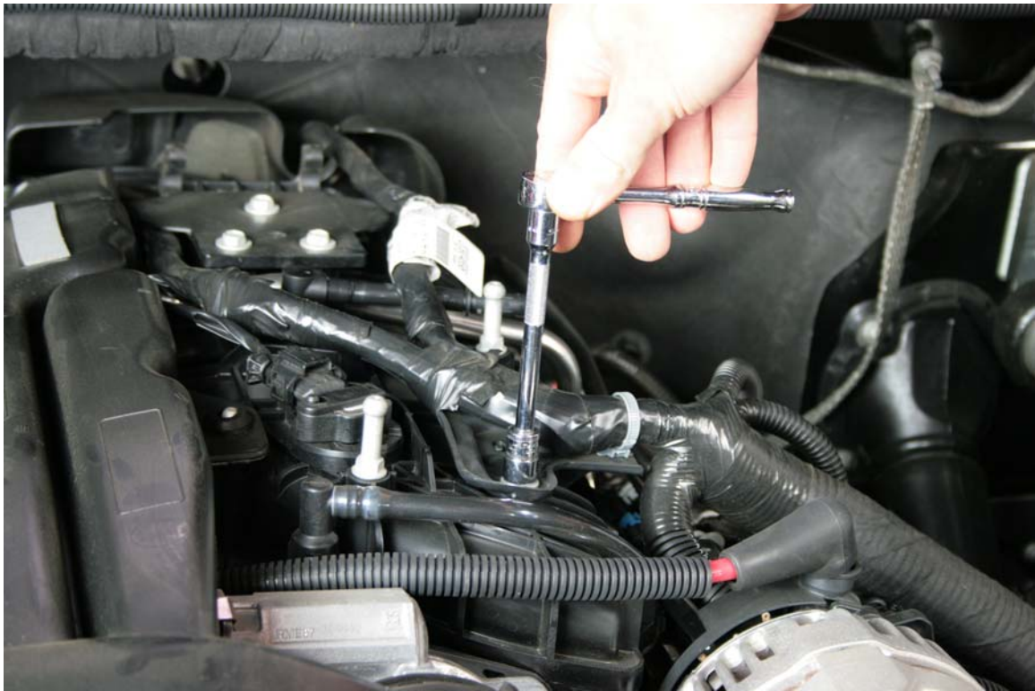
Step 15 Re-install wiring harness as shown