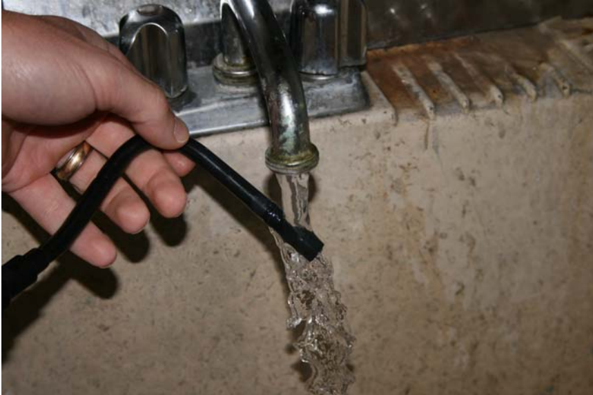
Step 11 Run cut end of PCV tube under HOT water, this step and the following step will need to be performed on both the female end and the male end