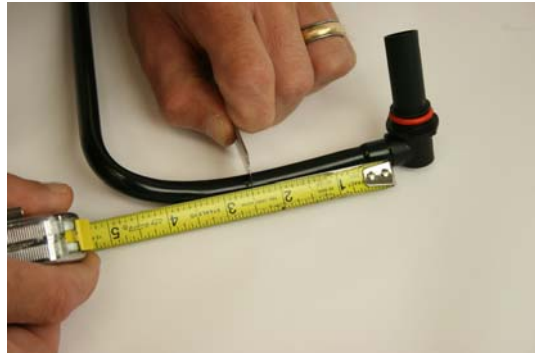
Step 9 Cut male end at 2 1/2"