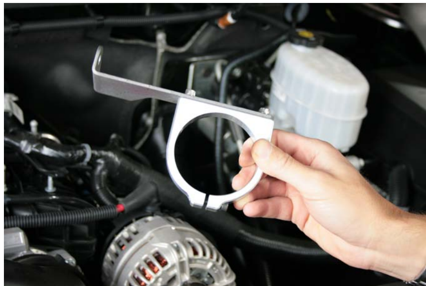
Step 17 Assemble billet bracket and stainless bracket as shown