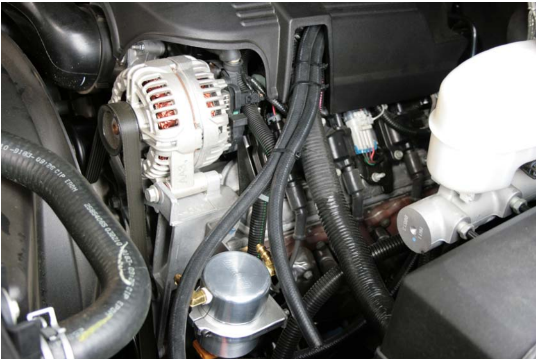
Step 23 Wire tie 3/8" lines as shown