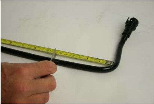
Step 8 Cut female end at 4"