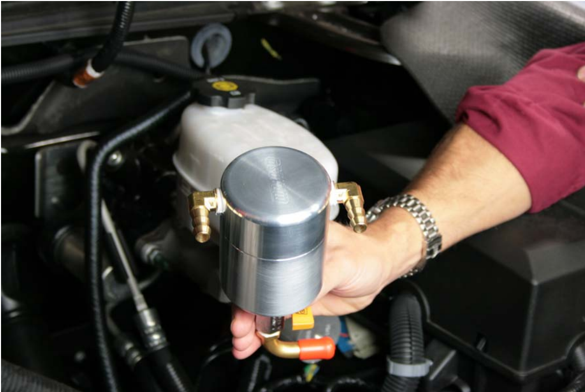
Step 19 Assemble air / oil separator as shown (note orientation of fittings, apply Teflon tape to all fittings)