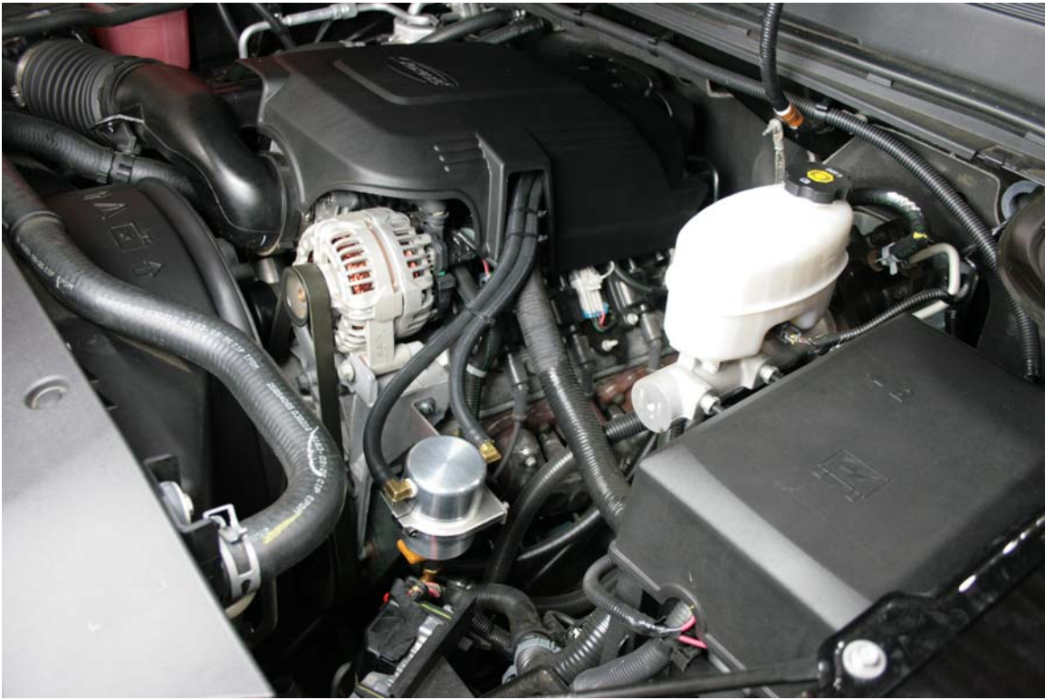
Final Installation of Late Model