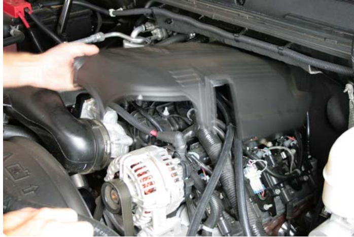
Step 22 Re-install intake cover