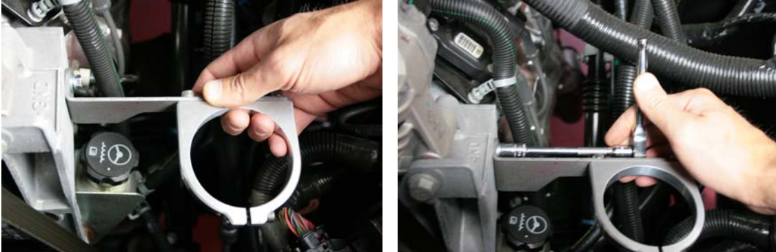
Step 18 Install billet / stainless bracket to upper hole on alternator bracket