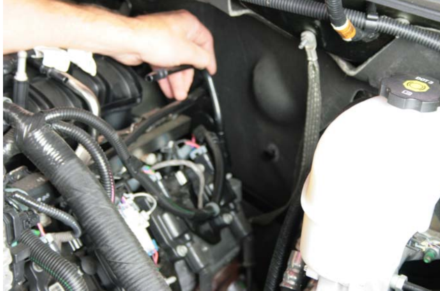
Step 16 Install female PCV tube in valve cover