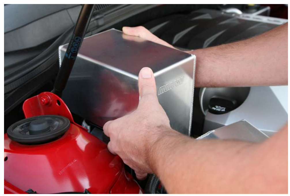
Step 4: Place cover over ABS pump