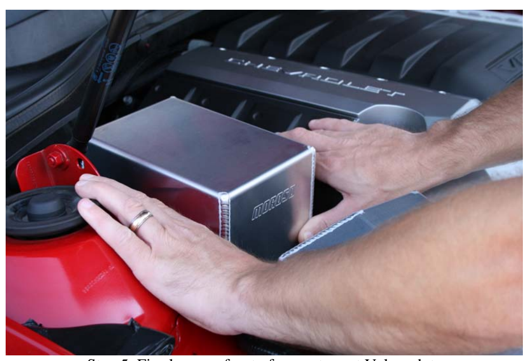
Step 5: Firmly press front of cover to seat Velcro dots