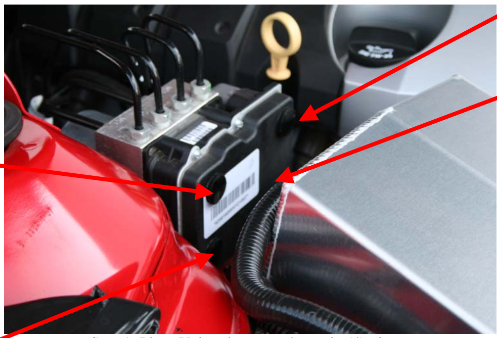
Step 1: Place Velcro loops as shown in (4) places