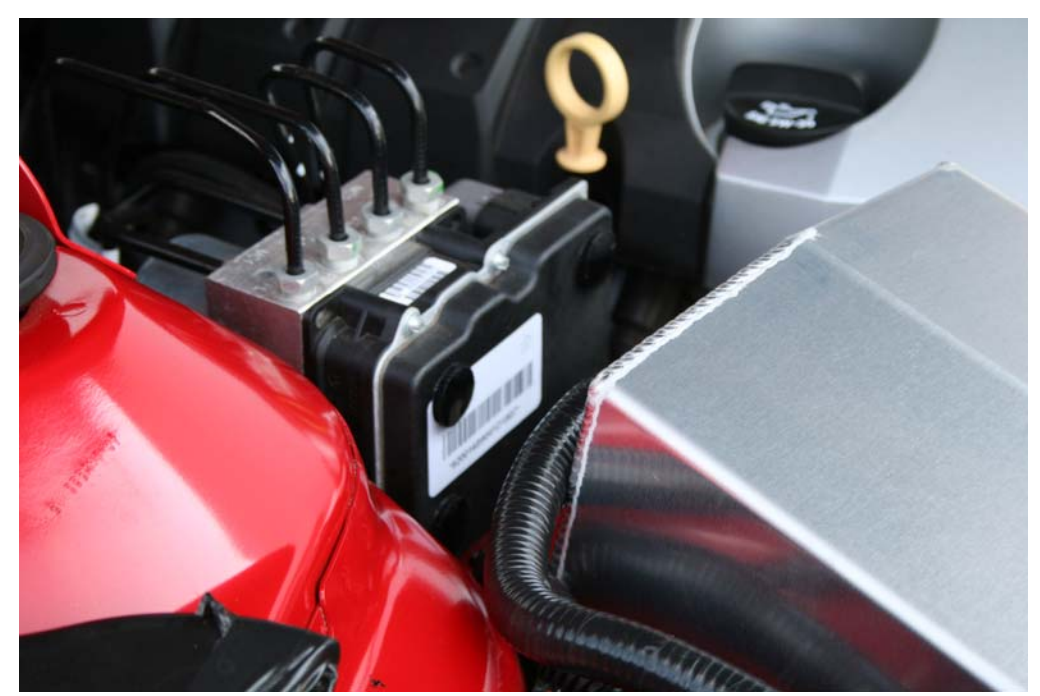
Step 2: Place Velcro hooks on top of Velcro loops previously installed