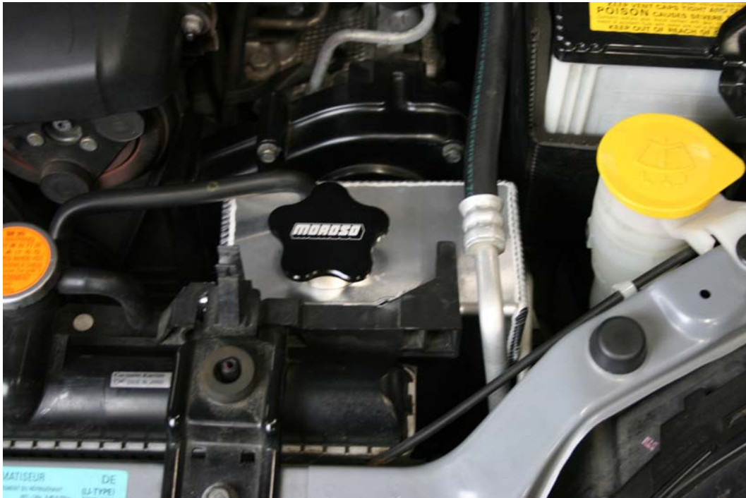
Step 13: Reinstall fill cap. Installation is complete