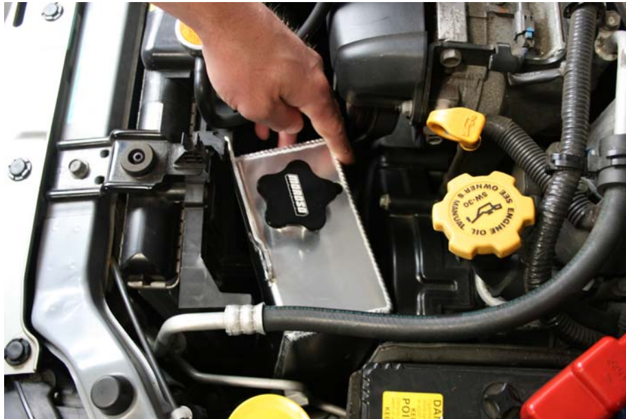
Step 6: Insert lower mount into bracket (on bottom of coolant tank)