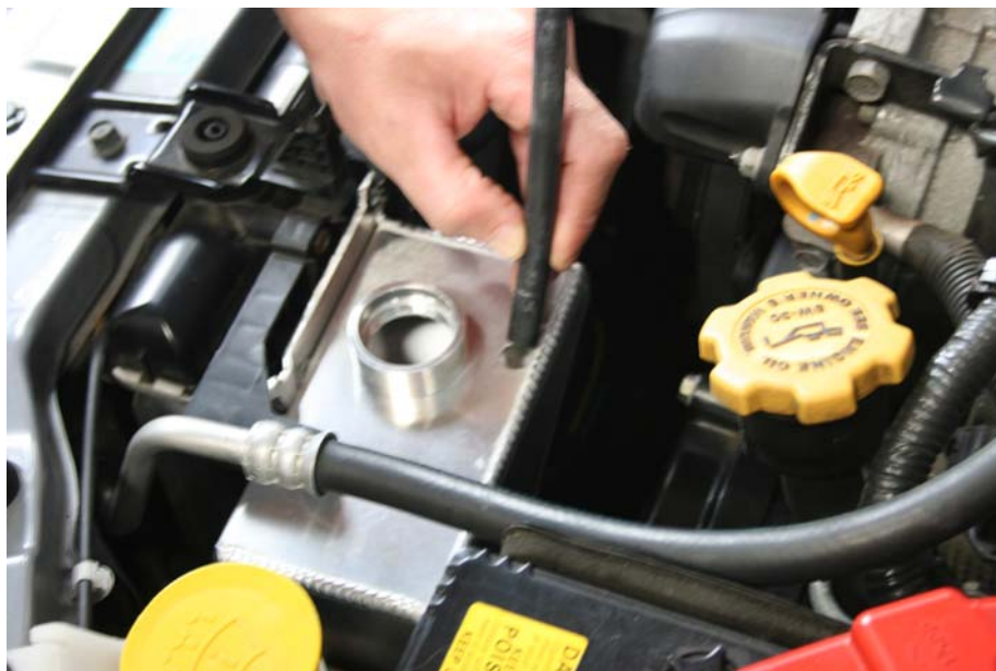
Step 10: Insert siphon tube into coolant tank