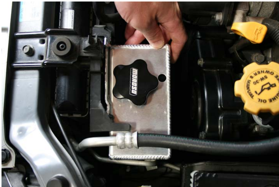
Step 8: Snap coolant Tank into hold down tab