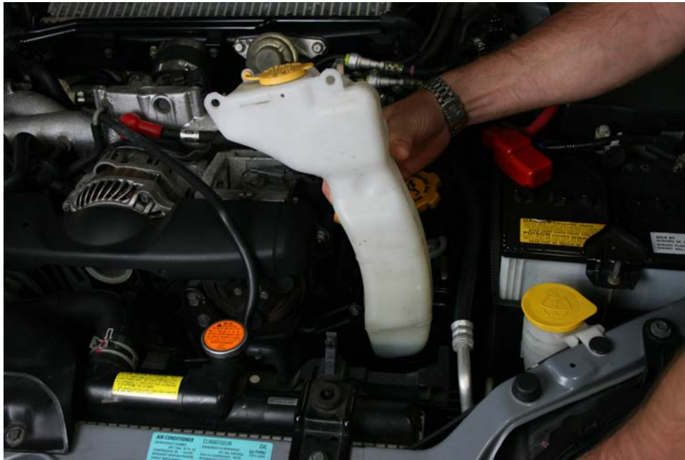
Step 4: Remove Coolant Tank from vehicle