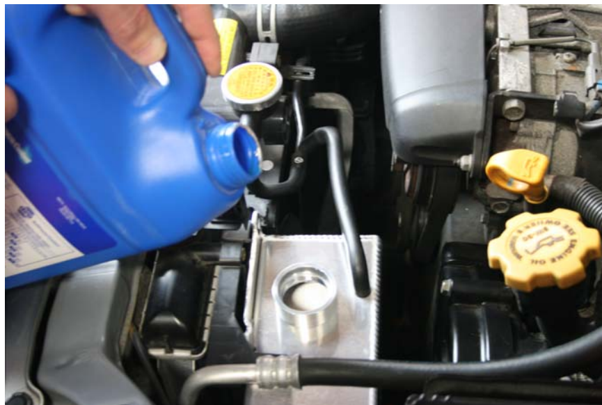
Step 12: Refill with 45 ounces of coolant