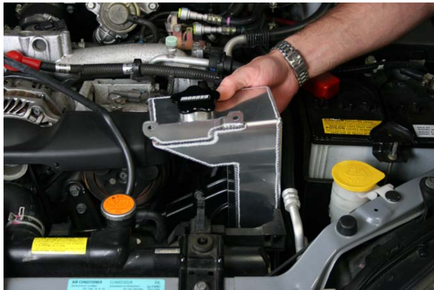
Step 5: Place New Coolant Tank into vehicle