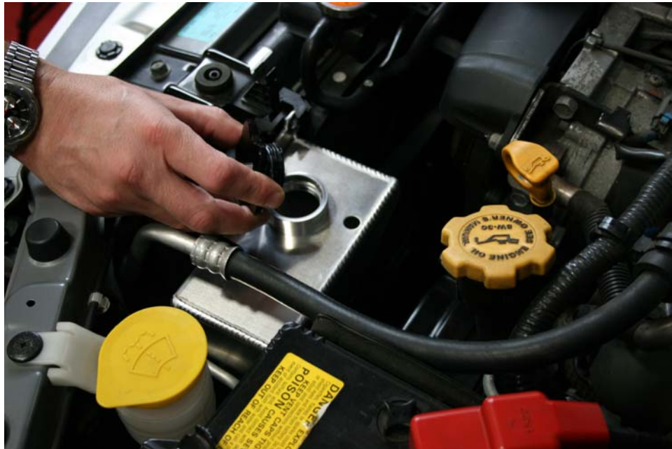
Step 9: Remove fill cap