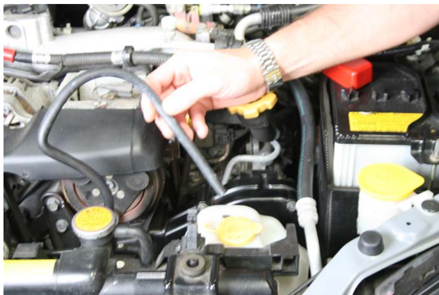
Step 2: Remove Siphon Hose from Coolant Tank