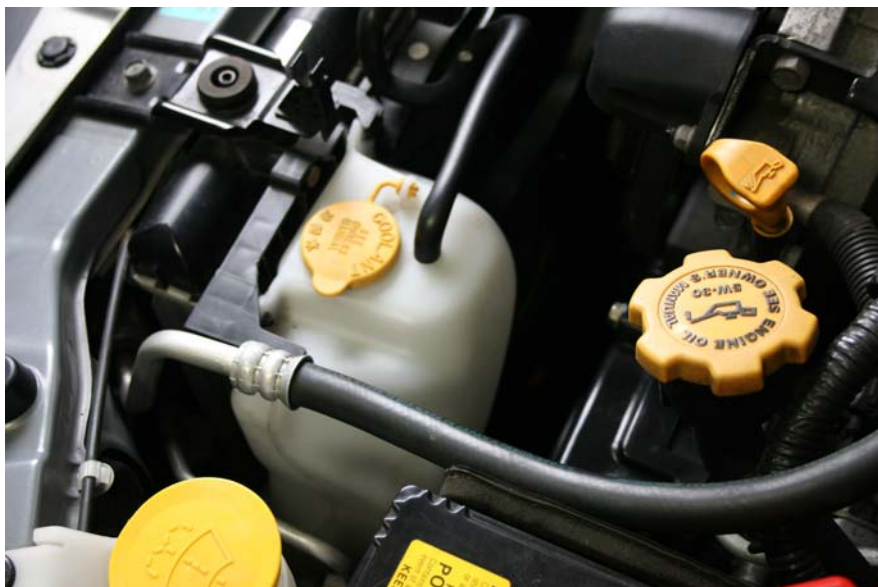
Step 1: Locate Coolant Tank