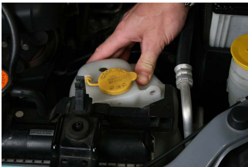
Step 3: Release hold down tab and twist tank to remove from mount