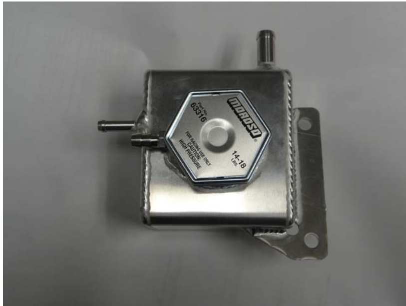
Step 3: Push down again and turn to second stop.