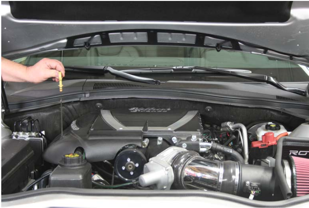
Step 1: Remove engine covers.