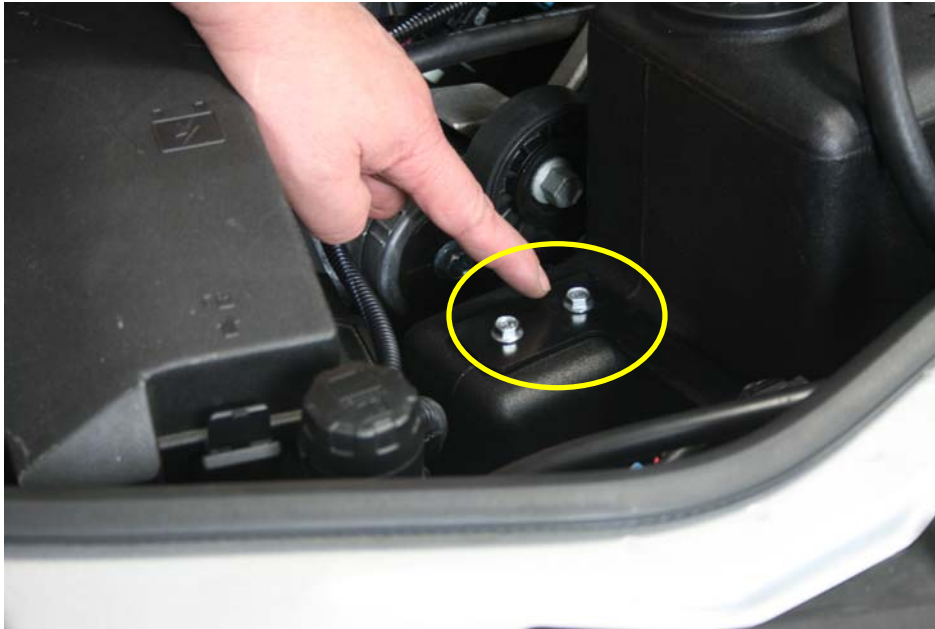
Step 12: Remove expansion tank mounting hardware