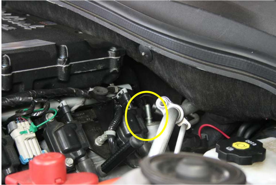
Step 2: Locate PCV nipple on driver's side rear valve cover.