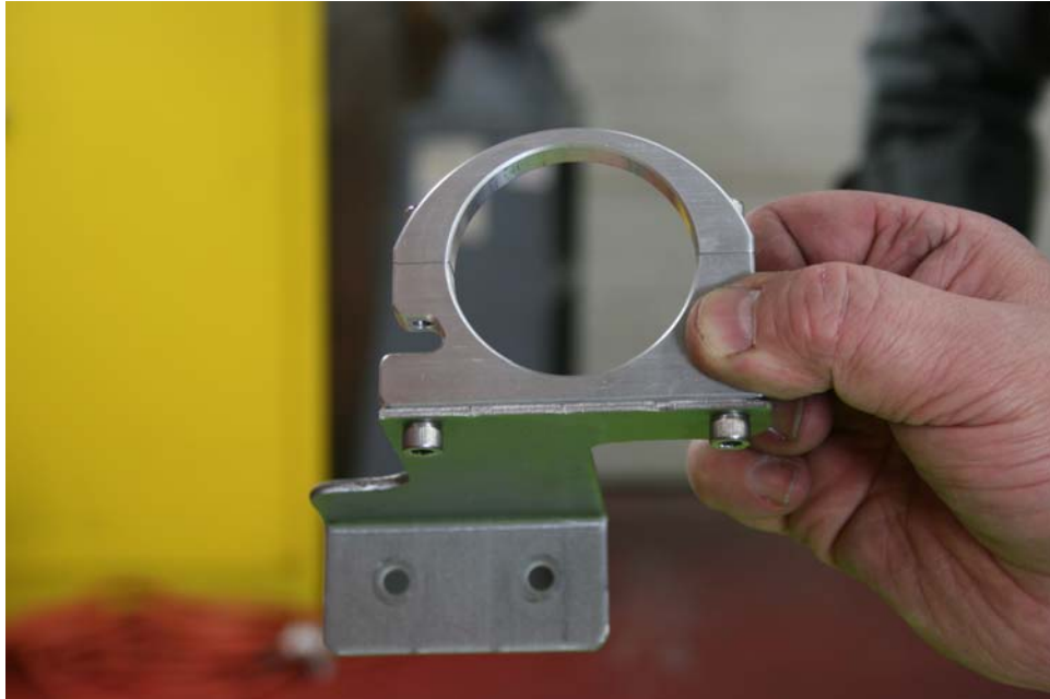
Step 11: Assemble billet clamp to stainless mounting bracket using (2) ¼-20x5/8 SHCS. Relief grooves will need to face down.