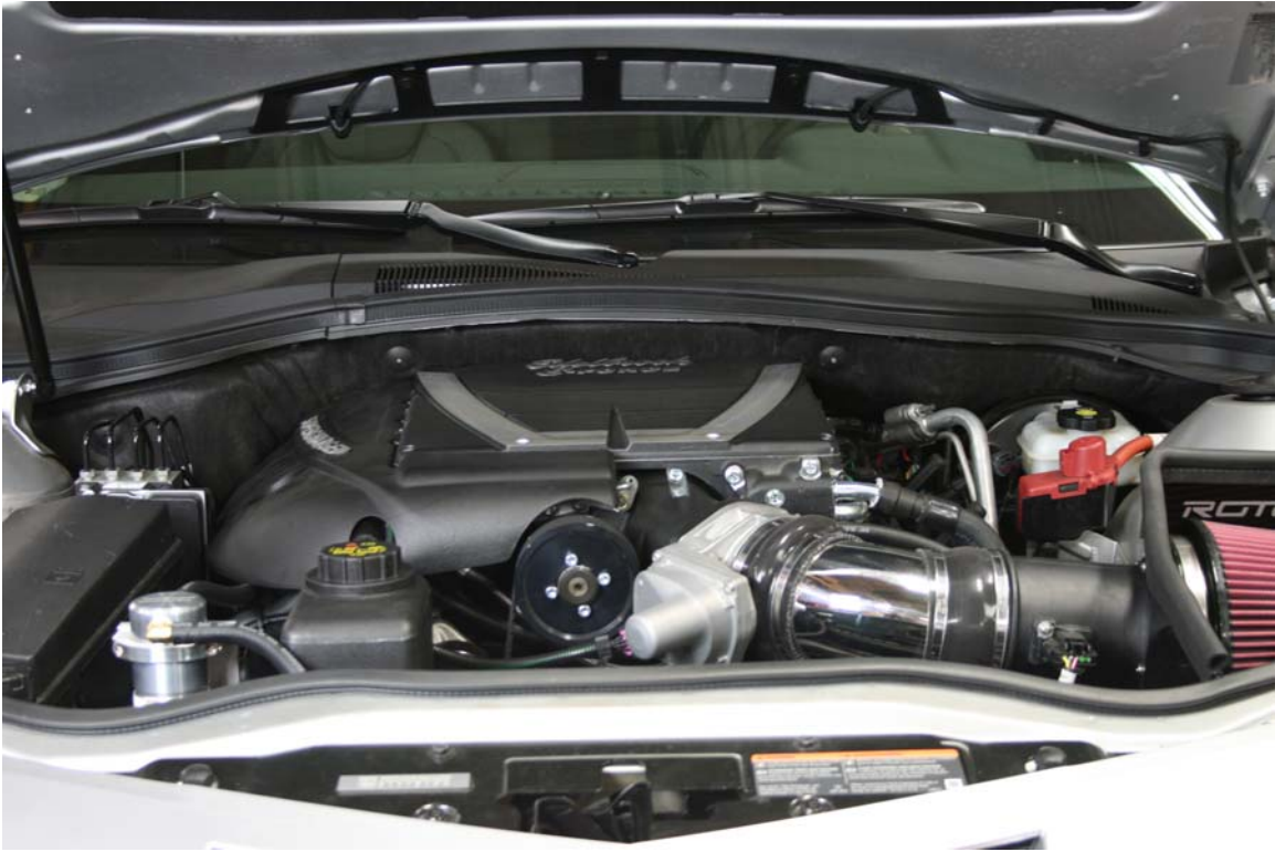
Step 16: Re-install engine covers. Installation Complete