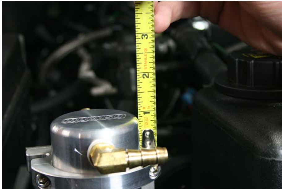
Step 15: Set height as shown from 1" to 1 1/8".