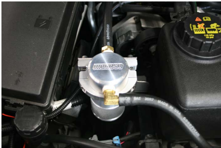
Step 16: Install 3/8 hoses to barbed fittings