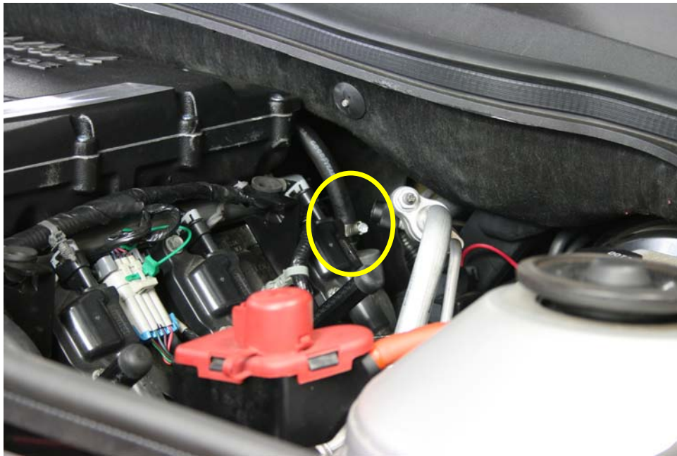
Step 5: Install hose using hose clamp.