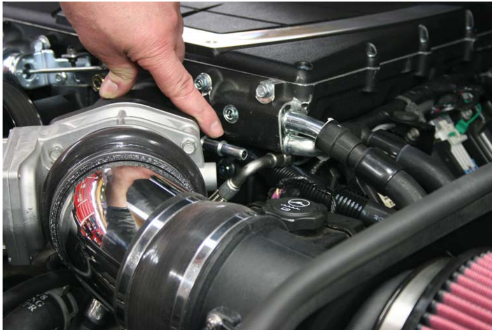
Step 3: Locate nipple on intake behind throttle body.