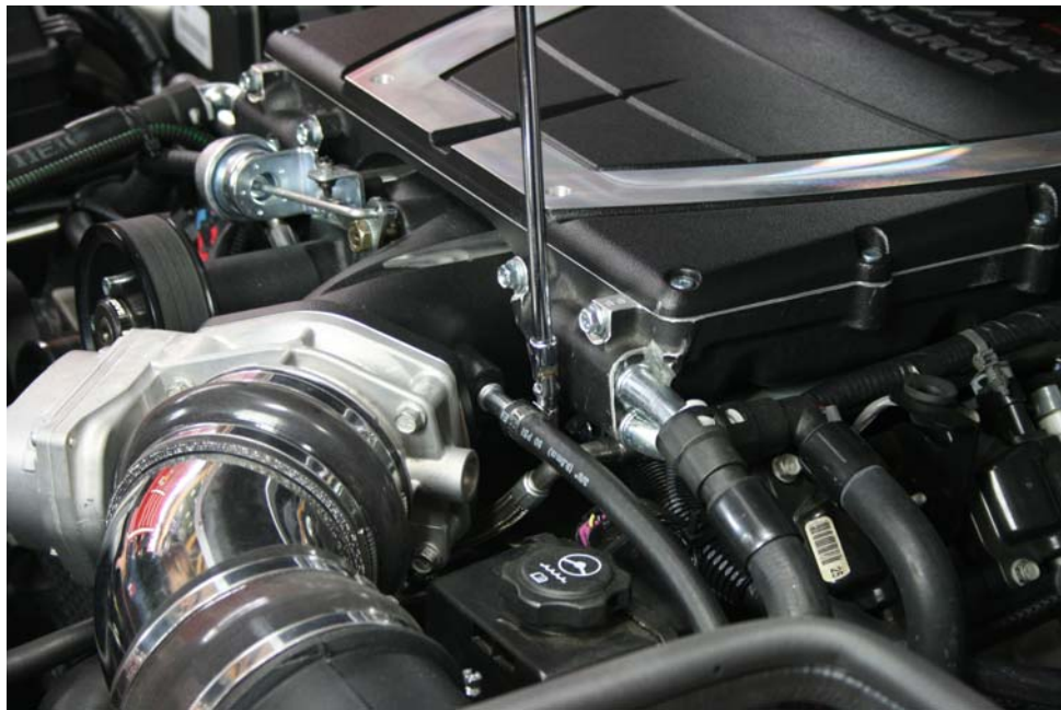
Step 7: Install 48" length of hose to intake nipple using hose clamp.