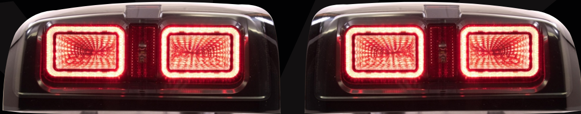
2X TAIL LIGHT ASSEMBLIES