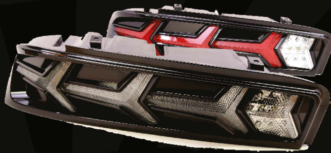
2X TAIL LIGHT ASSEMBLIES