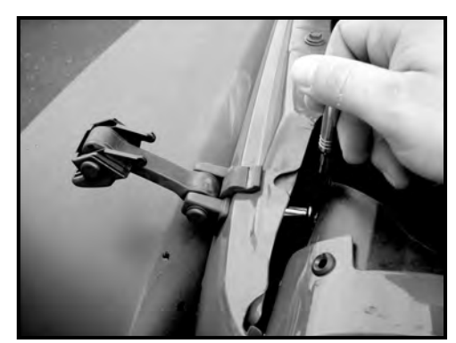
Figure 1a Figure 1b Figure 1c

Install original rubber bumpers onto new Stainless Hood Catches (Figure 2a). Notice - Failure to reinstall pad could result in paint abrasion. Install new Hood Latch and Hood Catch onto both sides of the vehicle (Figures 2b and 2c).