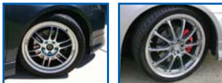
Examples of lowered Hondas with specialty rims and sport tires are shown here.

Therefore, proper alignment of these vehicles is important because many of them have expensive, soft compound performance tires, which will wear exceedingly fast if the vehicle is not aligned correctly.