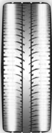
Inner/Outer Edge Wear

Camber that is out of specification will cause the vehicle to pull left or right and will create wear on the inside or outside edge of the tire.