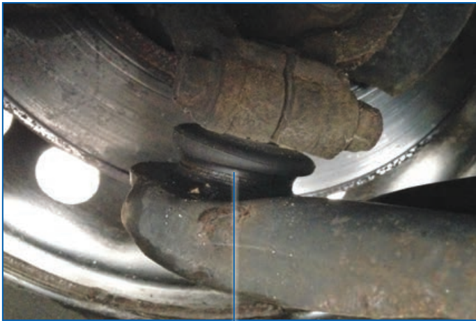
REPLACEABLE PART. REPLACE WITH MOOG® PROBLEM SOLVER® K500223 LOWER BALL JOINT.

OE dealers do not offer a replacement front lower ball joint by itself. So to replace the lower ball joint, installers must purchase the entire control arm.