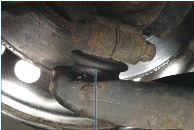
REPLACEABLE PART. REPLACE WITH MOOG® PROBLEM SOLVER® K500223 LOWER BALL JOINT.

OE dealers do not offer a replacement front lower ball joint by itself. So to replace the lower ball joint, installers must purchase the entire control arm.