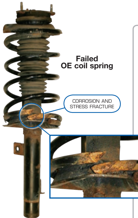
Failed OE coil spring

Stress and corrosion can cause front coil springs to fracture and fail, resulting in suspension noise and sagging.