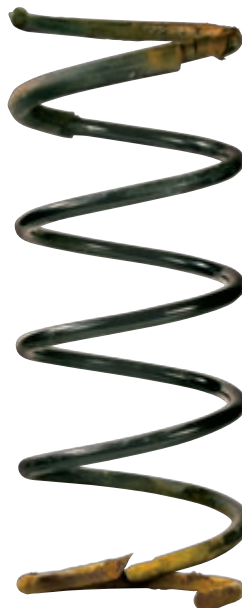
OE coil spring