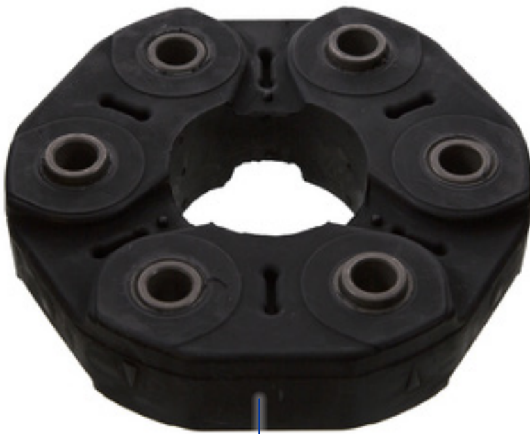
PREMIUM RUBBER MATERIAL