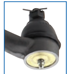
DS1235/1147 Track Bar