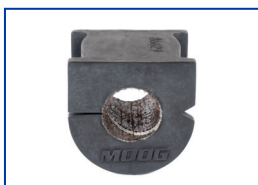
SYNTHETIC FABRIC LINED BUSHINGS INCLUDED WHERE APPLICABLE