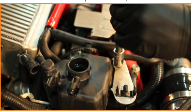
4. Remove the final nut holding the expansion tank in place. [1x 12mm nut]

3. Remove the bolts on the expansion tank. (2x 12mm bolts)