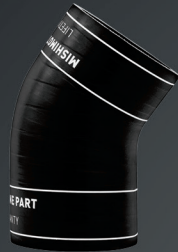
2003—2007 FORD 6.0L POWERSTROKE FACTORY-FIT HOT-SIDE UPPER BOOT MODEL: MMBK-F2D-03HU