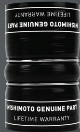
2003—2007 FORD 6.0L POWERSTROKE FACTORY-FIT COLD-SIDE LOWER BOOT MODEL: MMBK-F2D-03CL