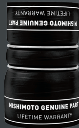
2003—2007 FORD 6.0L POWERSTROKE FACTORY-FIT HOT-SIDE LOWER BOOT MODEL: MMBK-F2D-03HL