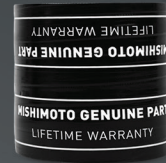
2003—2007 FORD 6.0L POWERSTROKE FACTORY-FIT COLD-SIDE UPPER BOOT MODEL: MMBK-F2D-03CU