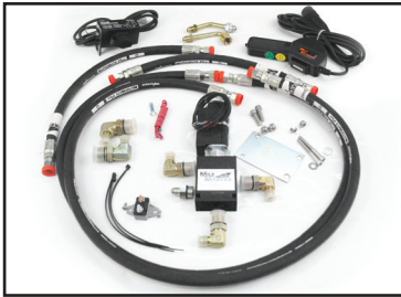
34 SERIES ADAPTER KIT REQUIRED. SEE APPLICATION CHART ON PAGE 9.