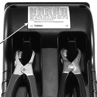
Serial Number Label