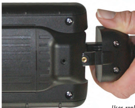
User-replaceable cable sets