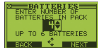
Test 1-6 batteries