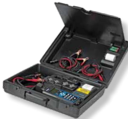
Alternator Circuit Test Procedure

Perform preventive maintenance testing in less than five minutes to reduce operating costs and increase the reliability of your fleet.