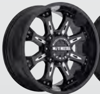
MM164B 18x9 • 20x9