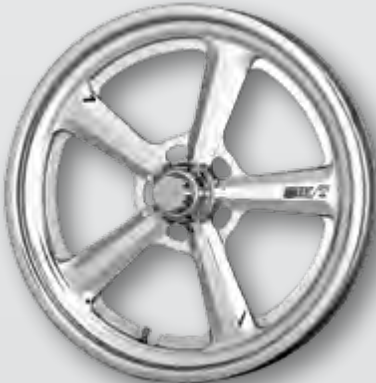
17" Dragster Front

One piece, fully forged and CNC-machined drag racing wheels offering the lightest practical weight and the greatest strength available from any aluminum wheel today.