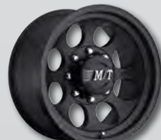
17 x 9 • 8 Lug