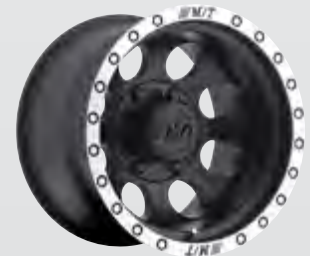
15 x 10 • 6 Lug