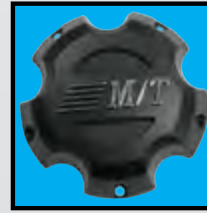
SIDEBITER II CAP