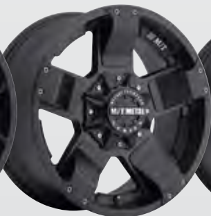
MM245 17x9 • 18x9 • 20x9