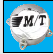
CLASSIC III CAP