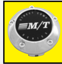
STREET COMP SC-5 CAP