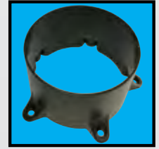
CLASSIC III BLACK OPEN CAP/ CLASSIC BAJA LOCK OPEN CAP