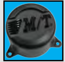
CLASSIC BAJA LOCK CAP