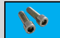
CAP SCREWS (SOLD WITH CAPS)

* Center caps ARE NOT available for certain applications including: 1997 & earlier Ford ¾ & 1-Ton Pickups, 2002 & earlier Dodge/Ram ¾ & 1-Ton Pickups, 1986 & earlier Jeep CJ Models & 1997 & earlier Toyota Land Cruiser Models