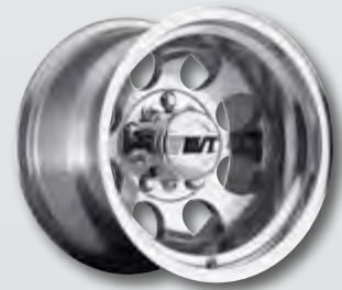
15 x 10 • 5 Lug