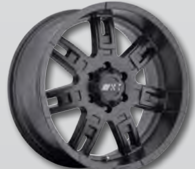
20 x 9 • 6 Lug

All SideBiter II wheels are designed to use bulge acorn (conical seat) lug nuts. Mickey Thompson recommends duplex bulge acorn lug nuts on vehicles of GVWR of 6,500 lbs or greater. * Hub centering ring included for late model Chevy/GMC application. Replacement center cap available. See Page 37.