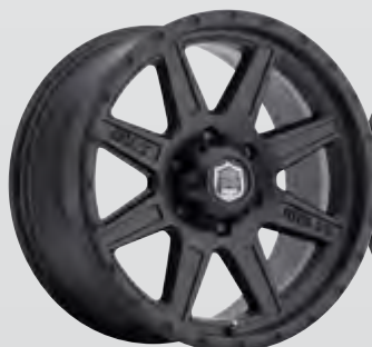
DEEGAN 38 PRO 2