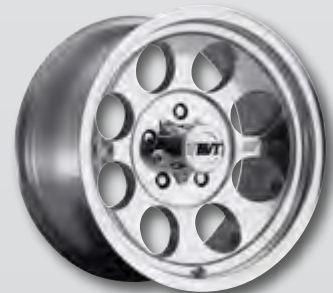
17 x 9 • 5 Lug