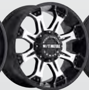
MM164M 18x9 • 20x9