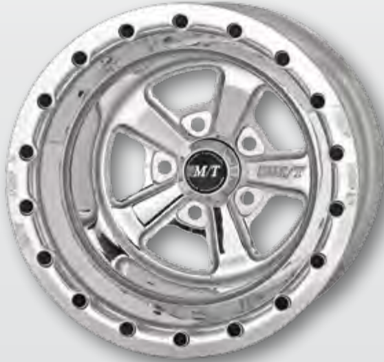
16" x 16" Double Bead Lock

The world's first one-piece, no weld, fully integrated bead-lock wheels provide state-of-the-art design and function for your drag race vehicle.