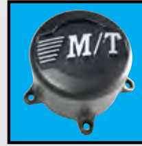
CLASSIC III BLACK CAP