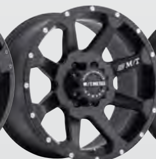
MM366 17x9 • 18x9 • 20x9