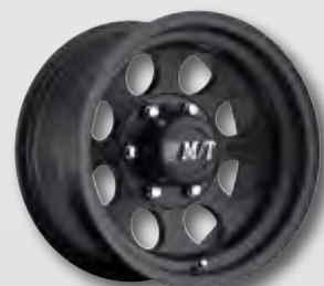
15 x 8 • 6 Lug