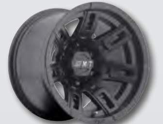
15 x 10 • 6 Lug