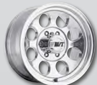
17 x 9 • 6 Lug

All Classic III wheels are designed to use bulge acorn (conical seat) lug nuts. Mickey Thompson recommends duplex bulge acorn lug nuts on vehicles of GVWR of 6,500 lbs or greater. *Hub centering ring included on select models for late model Chevrolet/GMC applications. ** WILL NOT FIT 1986 & EARLIER JEEP CJ MODELS † Special trailer application. Sold separately. Open Caps are available for 5, 6 and 8 lug wheels. Sold separately.