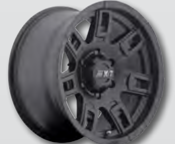
17 x 9 • 6 Lug