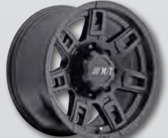
17 x 9 • 8 Lug