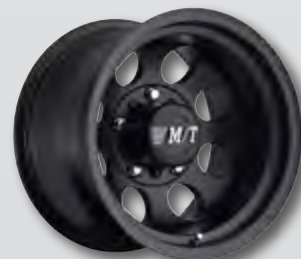
15 x 10 • 5 Lug