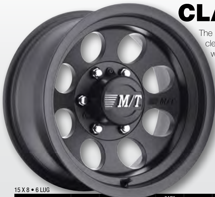
15 X 8 • 6 LUG