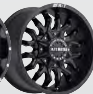
MM489 18x9 • 20x9