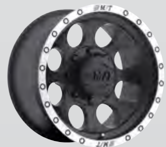
17 x 9 • 8 Lug