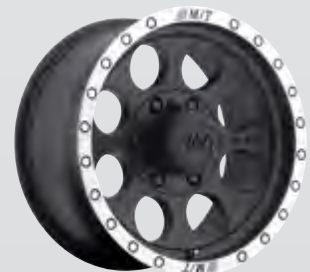
16 x 8 • 6 Lug