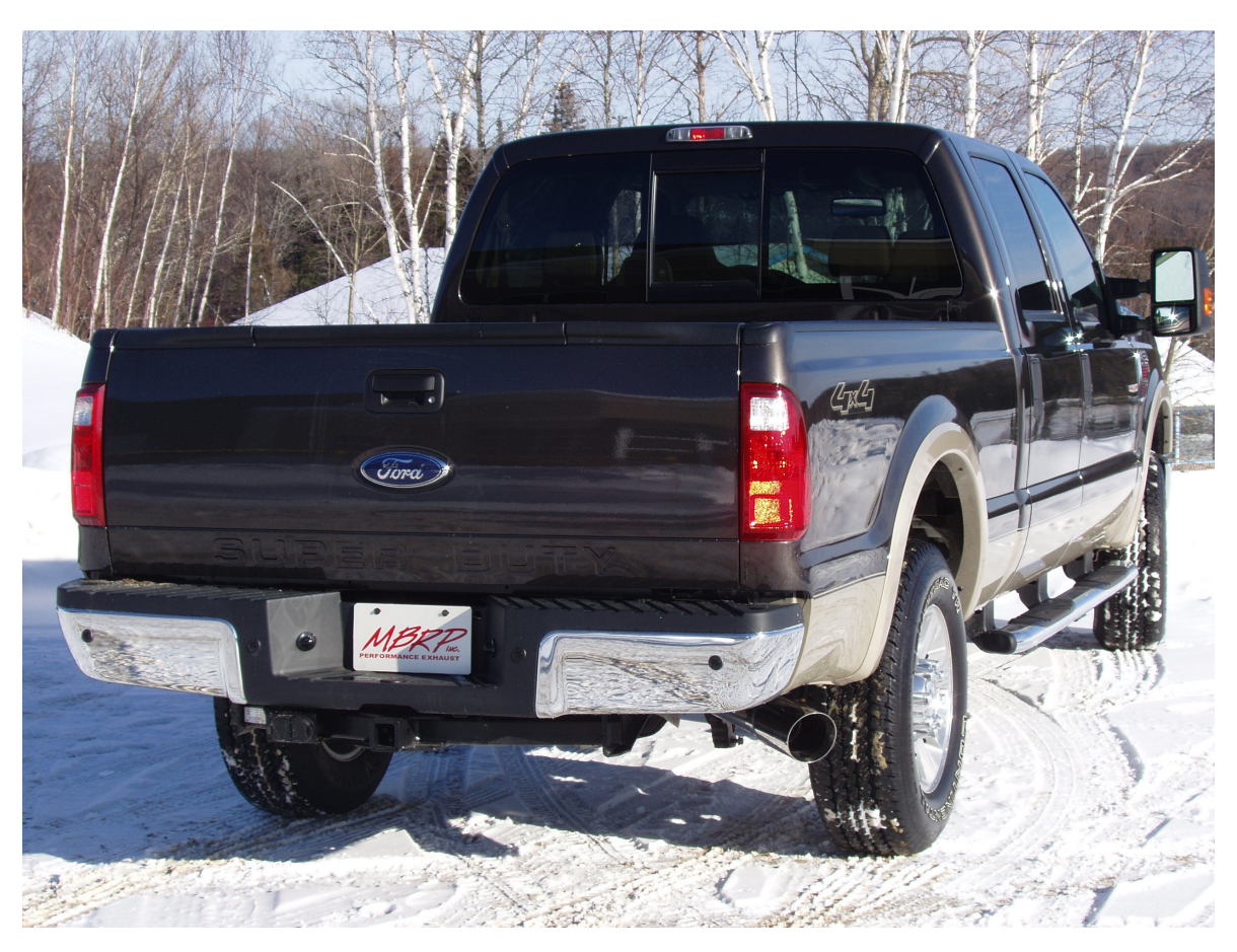
Congratulations! You are ready to begin experiencing the improved power, sound and driving experience of your MBRP Inc. performance exhaust system. We hope you enjoy your purchase.