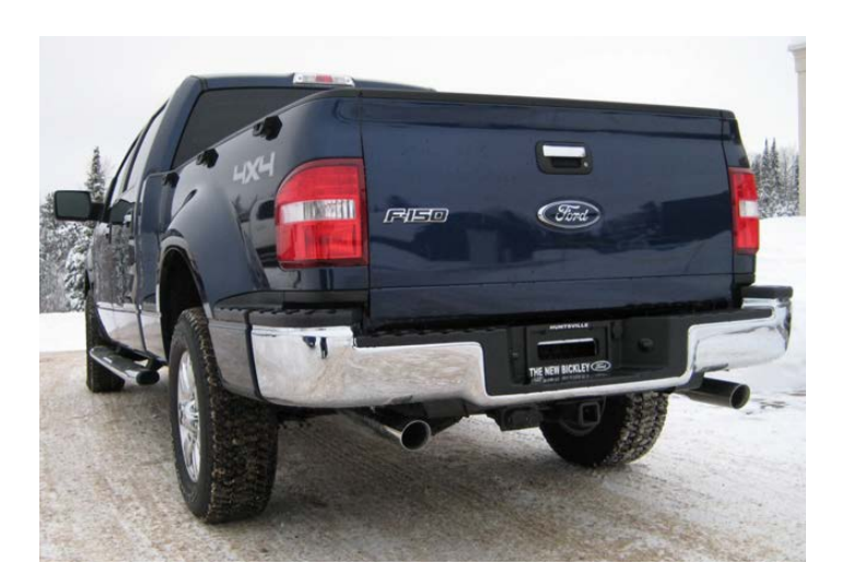
Congratulations! You are ready to begin experiencing the improved power, sound and driving excitement of your MBRP Inc. performance exhaust system. We know you will enjoy your purchase.