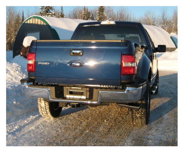
Congratulations! You are ready to begin experiencing the improved power, sound and driving excitement of your MBRP Inc. performance exhaust system. We know you will enjoy your purchase.