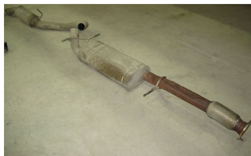
Figure 5 Removed stock system