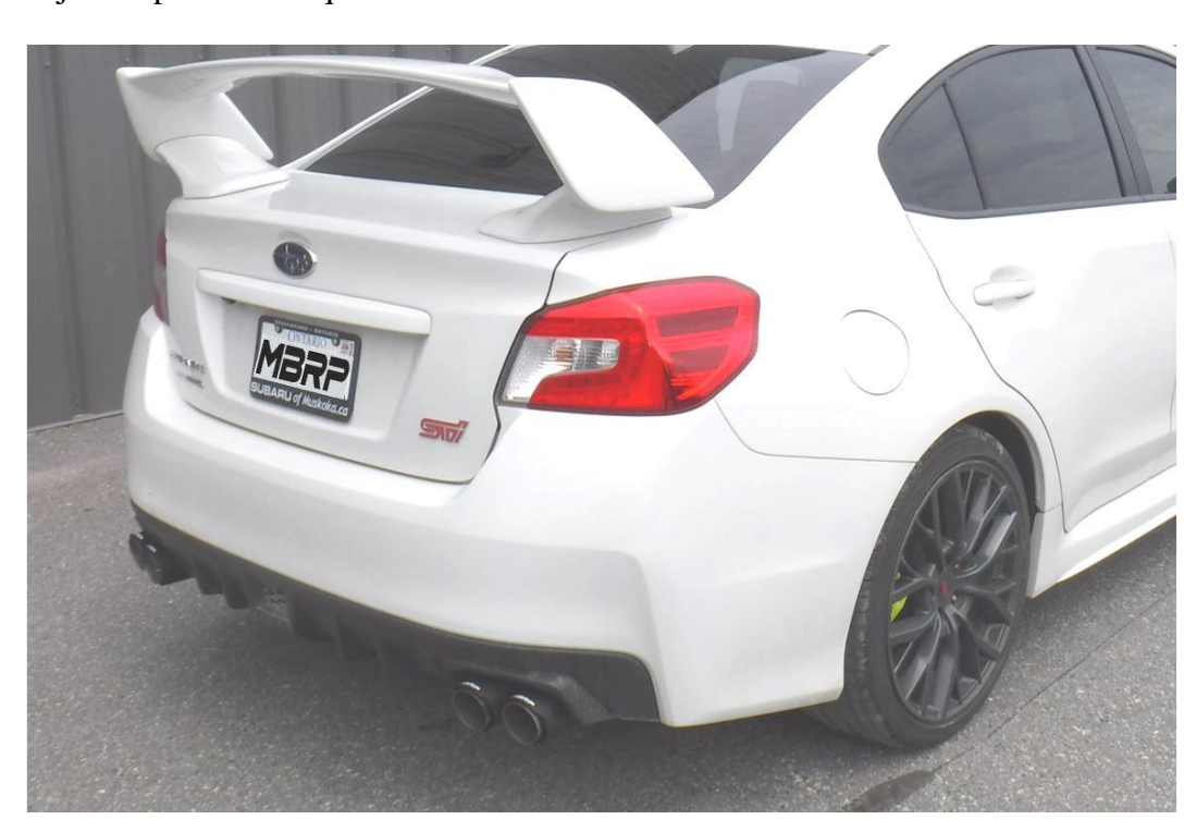
Congratulations! You are ready to begin experiencing the improved power, sound and driving experience of your MBRP Performance Exhaust. We know you will enjoy your purchase!

7. Tighten all hardware and clamps, starting at the front and working rearward to secure the system. Check along the full length of the exhaust system to ensure there is adequate clearance for fuel lines, vent lines, brake lines, frame, bodywork, suspension and any wiring, etc. If there is any interference detected, relocate or adjust to provide adequate clearance.