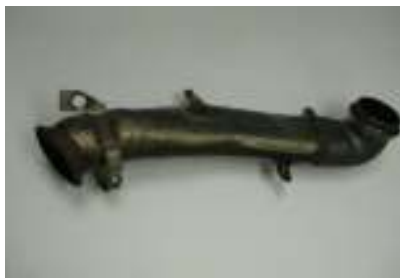
Stock Down Pipe Figure 6