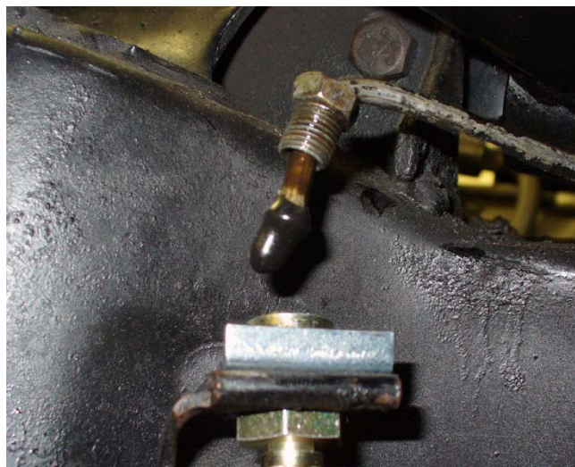
Figure 1 – Brake hose removal