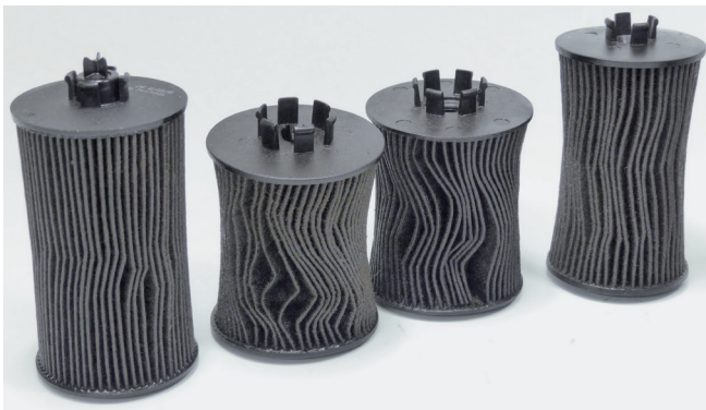
Figure 1: Collapsed oil filter inserts

Other circumstances can also result in damage to the filter paper, such as increased fuel input and a high biofuel content in the engine oil. An increase in short journeys and advanced engine wear can also lead to shorter replacement intervals.