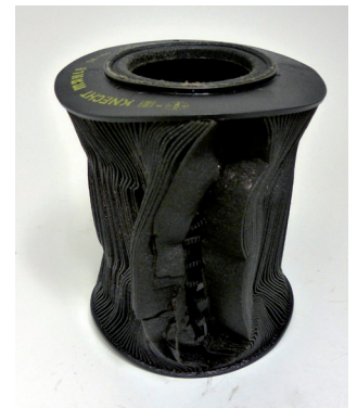
Figure 3: Oil filter insert deformed/torn as a result of overheating

IMPORTANT: Besides complying with the manufacturer's specifications, oil and filter changes should always be adapted to suit the individual driving profile! The use of high-quality engine oil can also reduce the load on the oil filter significantly.