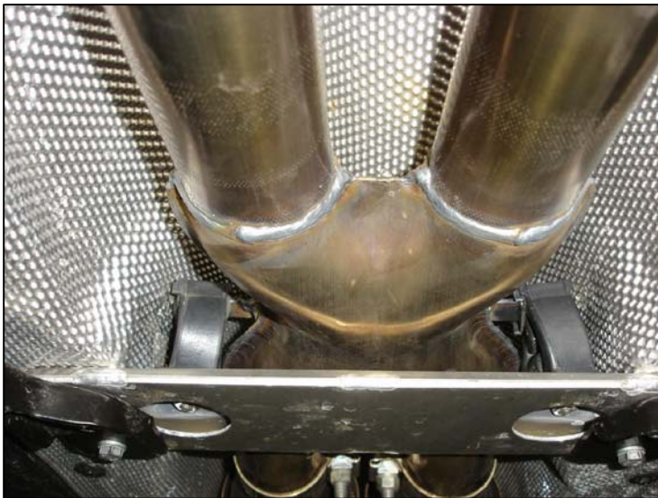
Fig # 2

Step 5: Once a final position has been chosen for the new system, evenly tighten all fasteners from front to rear. The supplied band clamps must be VERY tight to properly align the pipes and prevent leaks (Approximately 65ft-lbs). U-bolt clamps should be tightened to approximately 30-35ft-lbs. Inspect all fasteners after 25-50 miles of operation and retighten if necessary.