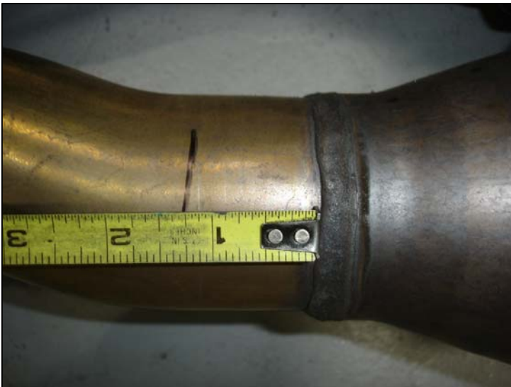
Fig # 1

Warning: When working on, under, or around any vehicle exercise caution. Please allow the vehicle's exhaust system to cool before removal, as exhaust system temperatures may cause severe burns. If working without a lift, always consult vehicle manual for correct lifting specifications. Always wear safety glasses and ensure a safe work area. Serious injury or death could occur if safety measures are not followed.