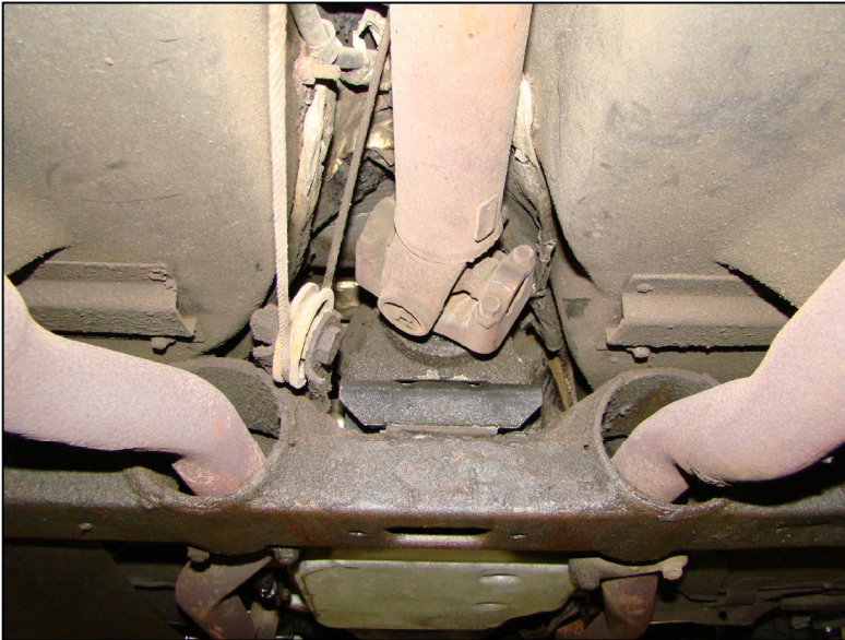
Fig # 1

Step 4: Once a final position has been chosen for the new system, evenly tighten all fasteners from front to rear. The supplied band clamps must be VERY tight to properly align the pipes and prevent leaks (Approximately 65ft-lbs). U-bolt clamps should be tightened to approximately 30-35ft-lbs. Inspect all fasteners after 25-50 miles of operation and retighten if necessary.