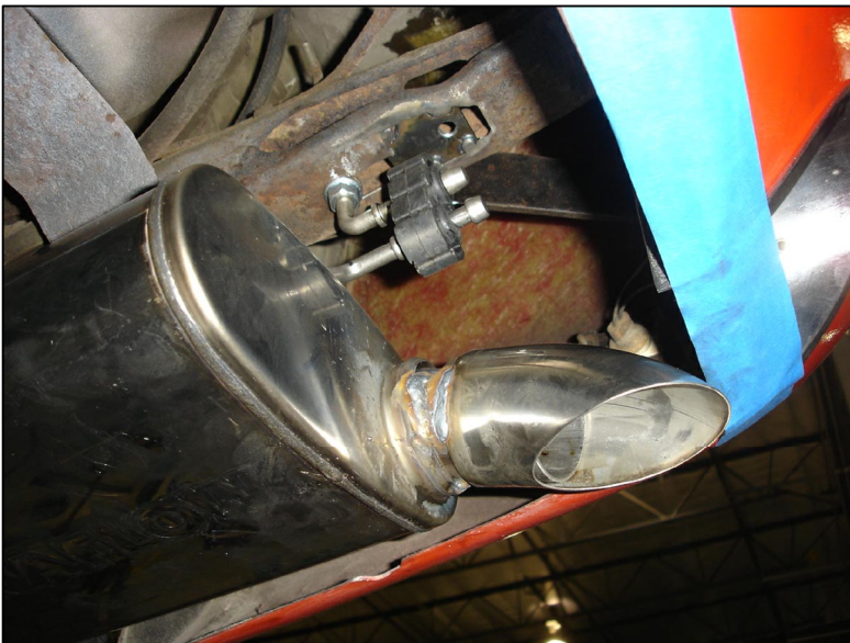
Fig # 2

Step 4: Once a final position has been chosen for the new system, evenly tighten all fasteners from front to rear. The supplied band clamps must be VERY tight to properly align the pipes and prevent leaks (Approximately 65ft-lbs). U-bolt clamps should be tightened to approximately 30-35ft-lbs. Inspect all fasteners after 25-50 miles of operation and retighten if necessary.