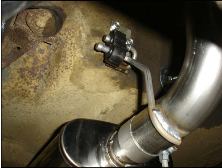
Fig # 1