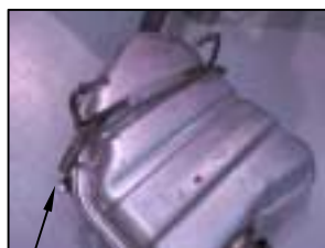
HANGER STRAP (TO BE REMOVED)