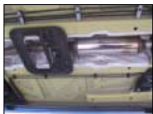
TUNNEL BRACE (TO BE RE-USED)