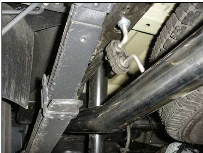
Dia # 2

2010– NISSAN TITAN 5.6L V8 CC–EC/SB DUAL REAR EXIT