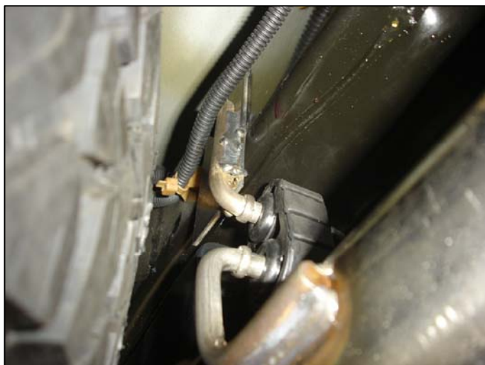
Dia # 3

Warning: When working on, under, or around any vehicle exercise caution. Please allow the vehicle's exhaust system to cool before removal, as exhaust system temperatures may cause severe burns. If working without a lift, always consult vehicle manual for correct lifting specifications. Always wear safety glasses and ensure a safe work area. Serious injury or death could occur if safety measures are not followed.