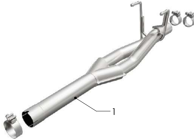
1. Y-PIPE ASSEMBLY