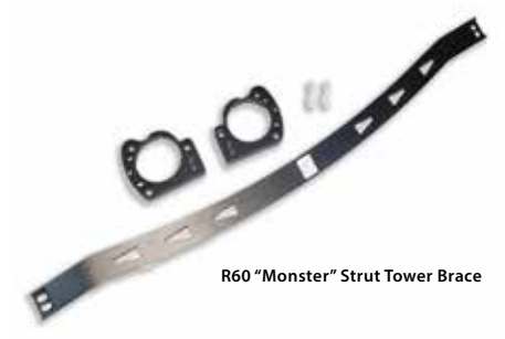
R60 "Monster" Strut Tower Brace