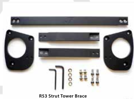
R53 Strut Tower Brace