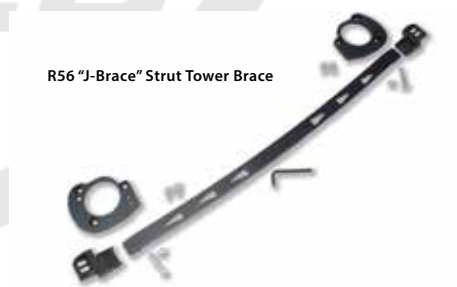
R56 "J-Brace" Strut Tower Brace