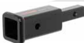
1 1/4" to 2" Receiver Adapter