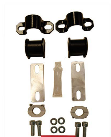
Figure 1: Supplied Hardware Kit