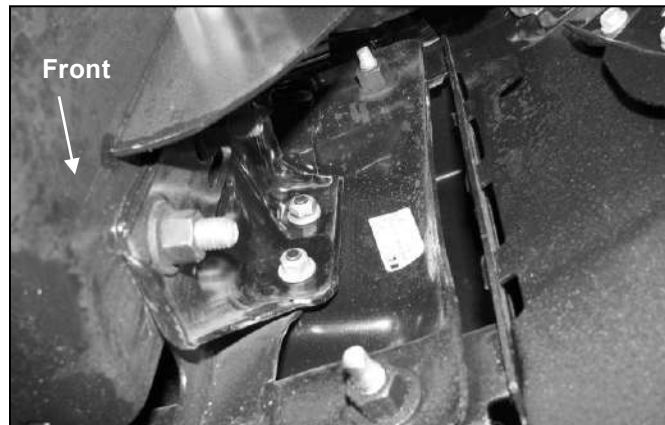
(Fig 2) Tow hook mounting hardware from behind the passenger/right side of the bumper

Remove the (4) hex bolts holding the passenger side tow hook to the frame, (Figure 1) . Remove the tow hook, (Figure 3) . TIP: Removing the inner hex bolts securing each tow hook can be difficult to reach from behind the bumper, (long socket extensions required). It may be easier to access the (2) hex bolts by going through the front of the bumper and holding the hex nuts in place with an open-ended wrench, (Figure 2) . Repeat this Step to remove the driver side tow hook.