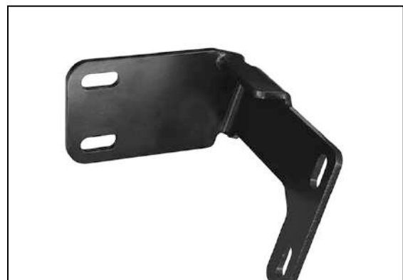
(Fig 4) Passenger/right Mounting Bracket