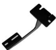
Passenger Side Front Bracket x1