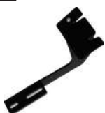
Driver Side Front Bracket x1

NOTE: Actual product may vary from illustration.