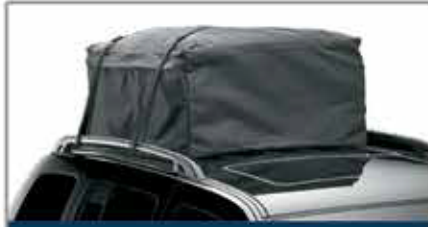
SOFT PACK ROOFTOP BAG