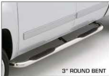
3" ROUND BENT