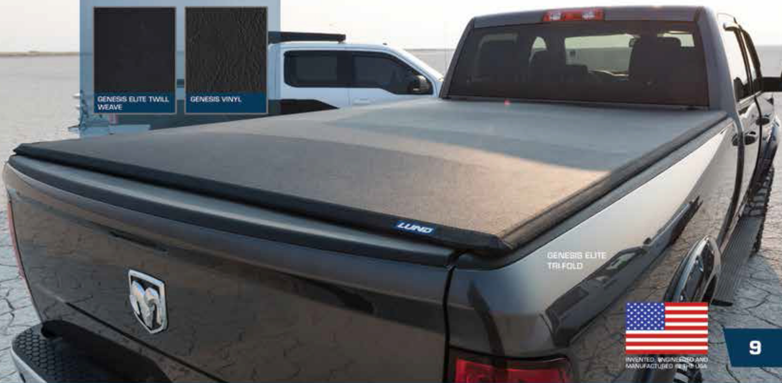
GENESIS ELITE TRI-FOLD