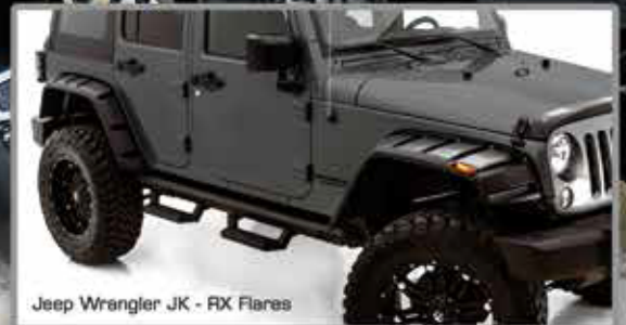
Jeep Wrangler JK - RX Flares