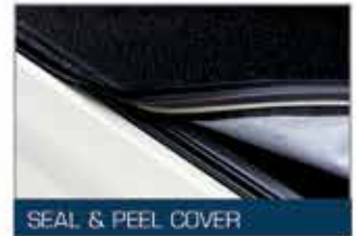
SEAL & PEEL COVER