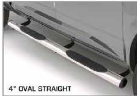
4" OVAL STRAIGHT