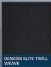
GENESIS ELITE TWILL WEAVE