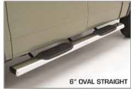
6" OVAL STRAIGHT