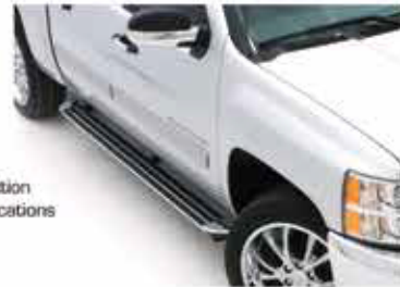
Durable Aluminum construction for Truck & SUV/CUV applications