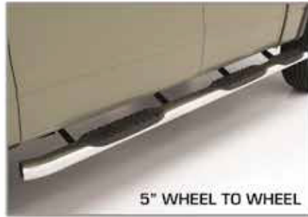
5" WHEEL TO WHEEL