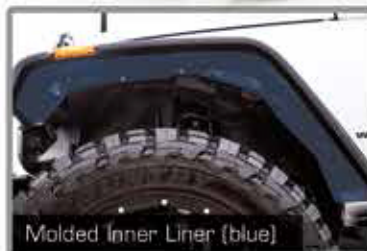
Molded Inner Liner (blue)