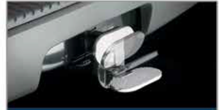
HITCH STEP universal