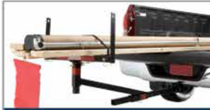
HITCH RACK BED EXTENDER