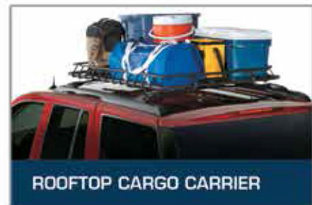
ROOFTOP CARGO CARRIER