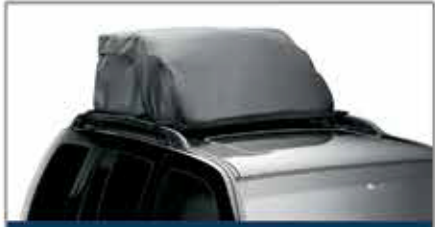
AERO ROOFTOP BAG