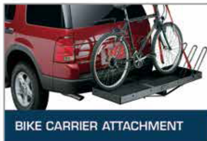
BIKE CARRIER ATTACHMENT