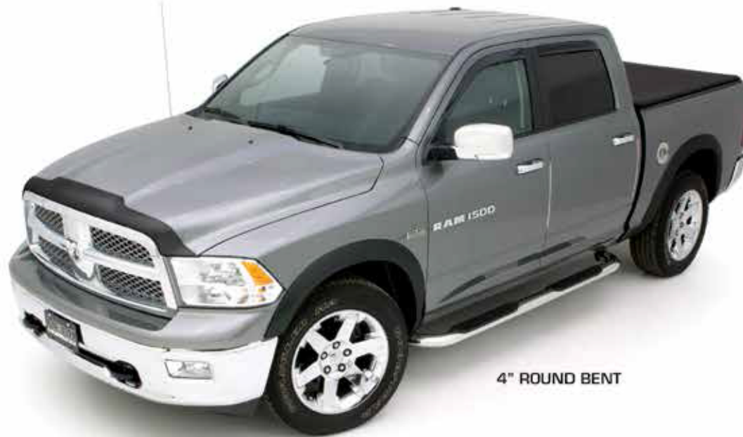
4" ROUND BENT