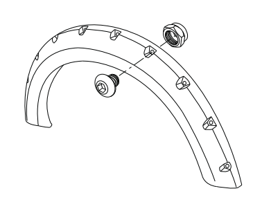
For Rivet Style Only