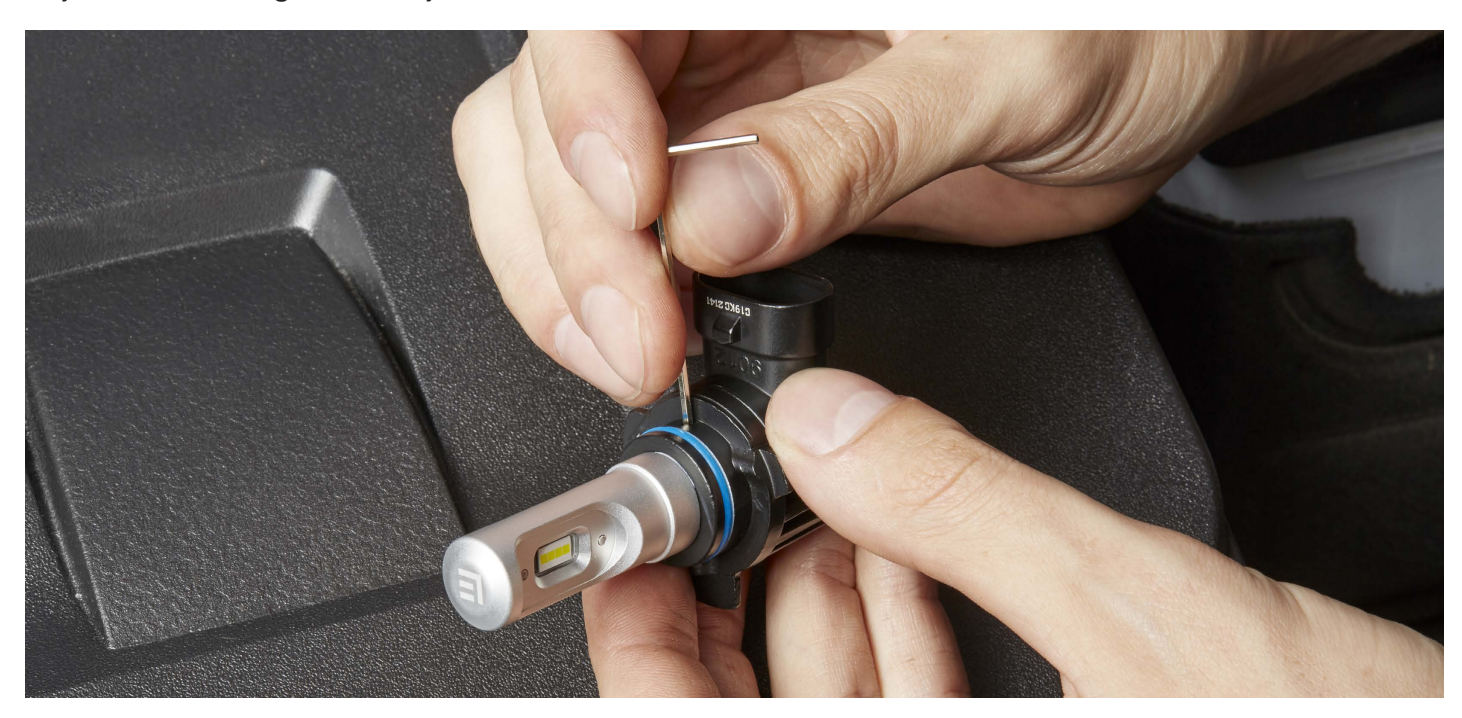
STEP 6. If the front of the bulb is not in the correct position, you will need to remove the bulb and adjust it according to the adjustment instructions.