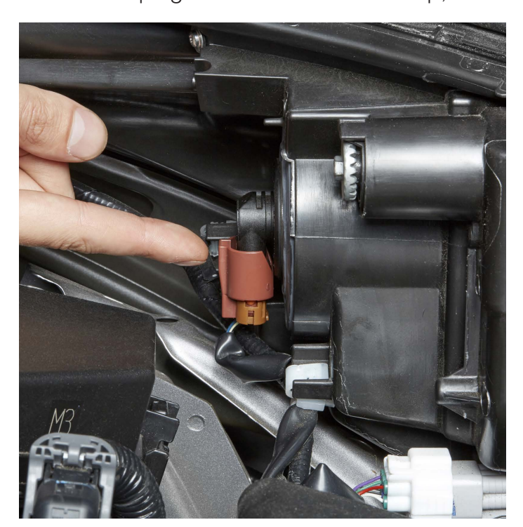
STEP 3. Unplug the bulb in the headlamp, remove the bulb.

STEP 2. If there is a cover on the back of the headlamp, remove the cover.