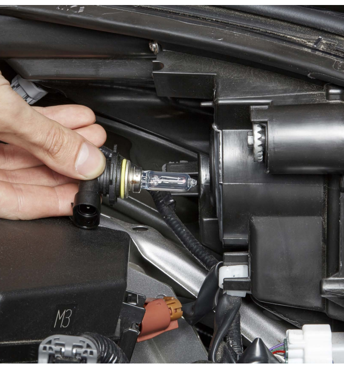
STEP 4. Place the new G10 LED conversion bulb in the socket and make sure it is secure.