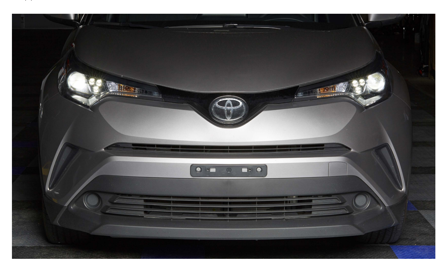
STEP 8. Turn on your headlights and ensure proper operation of bulb on low beam and high beam if applicable.

Check out other lights offered in our online store.