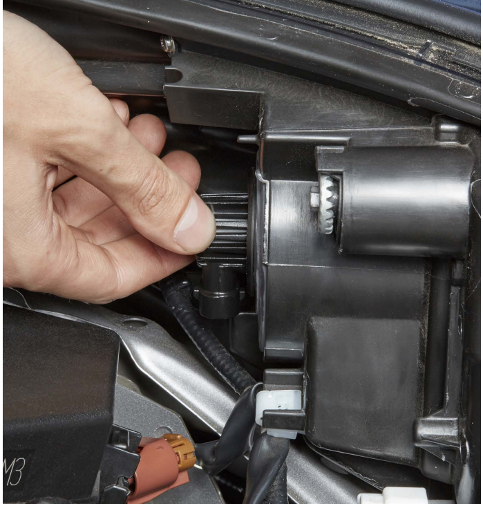
STEP 5. While looking into the headlamp from the front of the vehicle, ensure the bulb is in the correct orientation according to the adjustment instructions included in the box.