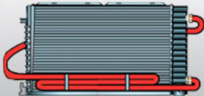
Transmission cooling line flush cleaner