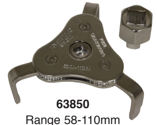
63850 Range 58-110mm