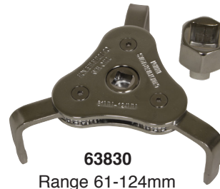
63830 Range 61-124mm