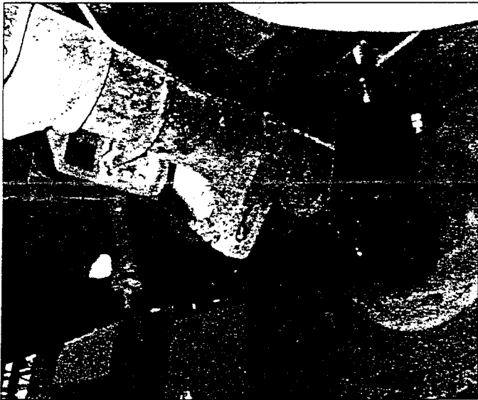
Rear bracket with mounting clamp on top of spring.

RETAIN THIS INSTRUCTION SHEET FOR FUTURE REFERENCE.