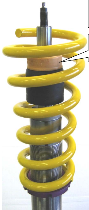
Supplied coilover strut.

Put the original supporting bearing on the coilover strut and fix it with the supplied stopp nut. Tightening torque for the piston rod is 35 Nm (26 ft-lb). Please install the strut unit to manufacturers recommended settings regarding tightening torque and fixing specifications.